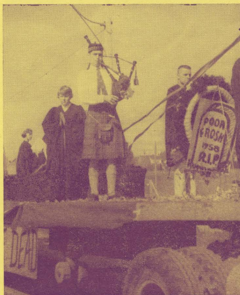
One of the many colourful floats in last year's parade

10:30 —Presentation of the Solid Gold Cup.