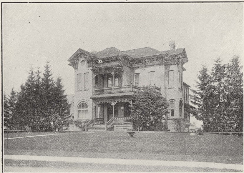
THE FIRST SEMINARY BUILDING 1911—1914

During the short history of our College and Seminary, these institutions have, in the providence of God, proven themselves of inestimable value in helping to preserve and extend our Lutheran Church in Canada. Our people, too, have appreciated this and have supported them nobly, thank God. May it now please the Lord to open the eyes of all of us to see the present critical situation of our school and may He move our hearts to a hearty approval for the relief which has been planned.