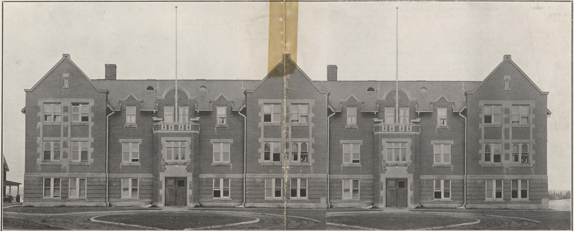
WATERLOO COLLEGE AND SEMINARY BUILDING AS IT WILL APPEAR WITH THE PROPOSED ANNEX