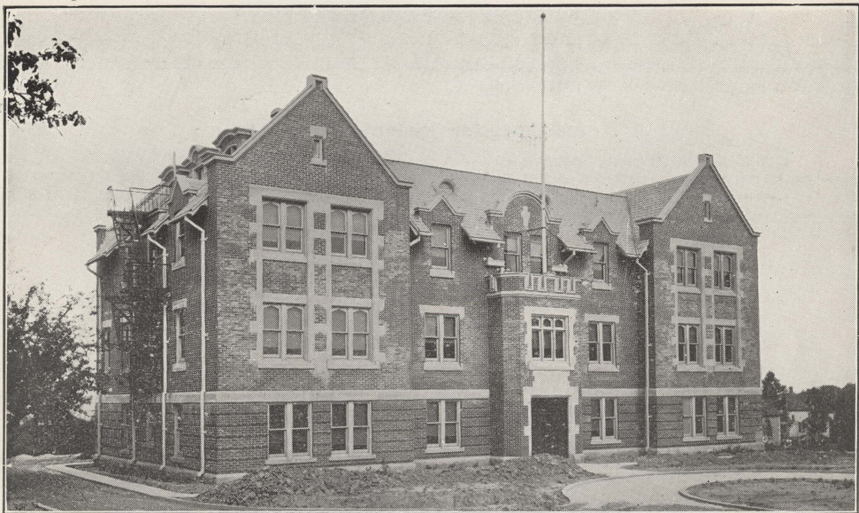
OUR SCHOOL AS IT APPEARS TO-DAY