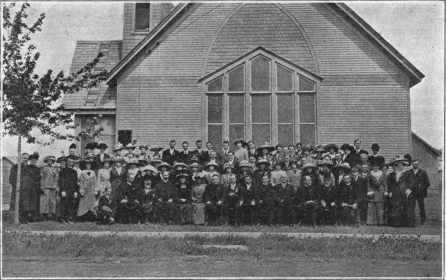
Delegates to the Luther League Convention.