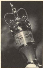
Detail of the Wilfrid Laurier University mace

Honorary degrees are conferred by Wilfrid Laurier University in recognition of outstanding scholarly, creative, or professional achievement or distinguished public and community service. The University may grant the following honorary degrees: Doctor of Laws (LLD), Doctor of Letters (DLitt), Doctor of Science (DSc) and Doctor of Divinity (DDiv).