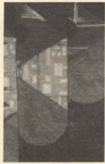
A section of the Faculty of Music banner

one to the other in a scattering of small squares over the surface. The superimposed squares shift in colour from purple to blue, and from gold to white, representing the colours associated with Business and Economics. This method of blending two contrasting colours together is drawn directly from computer technology using a graphics software program that assigns one of two colours to each pixel according to an appropriate algorithm. This results in a smooth blend overall, while retaining interesting unevenness in detail. Variations in surface texture and lustre in the fabrics cause light to reflect from the surface of the banner in different ways, further adding to the overall effect. The banner was designed and made by Ellen Adams.