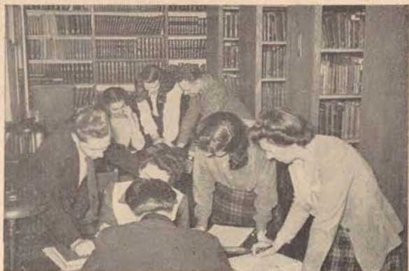
Our Library provides seating room for 30 out of 180 students.