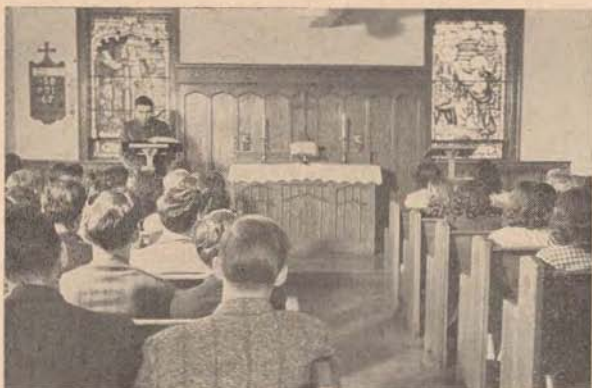
Our Chapel is too small.