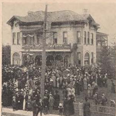
DEDICATION DAY OF THE EVANGELICAL LUTHERAN SEMINARY OF CANADA, 1911