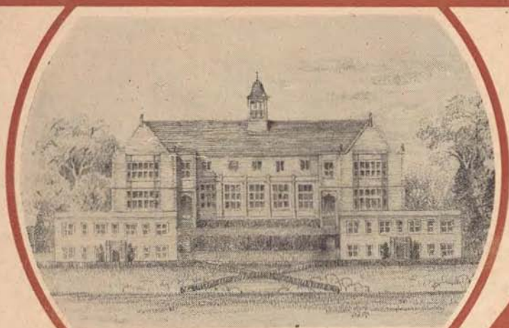
FUTURE TEACHING BLDG.