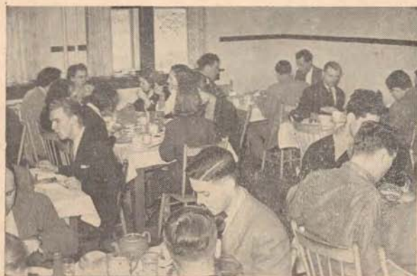
Resident students are crowded into a small dining room.