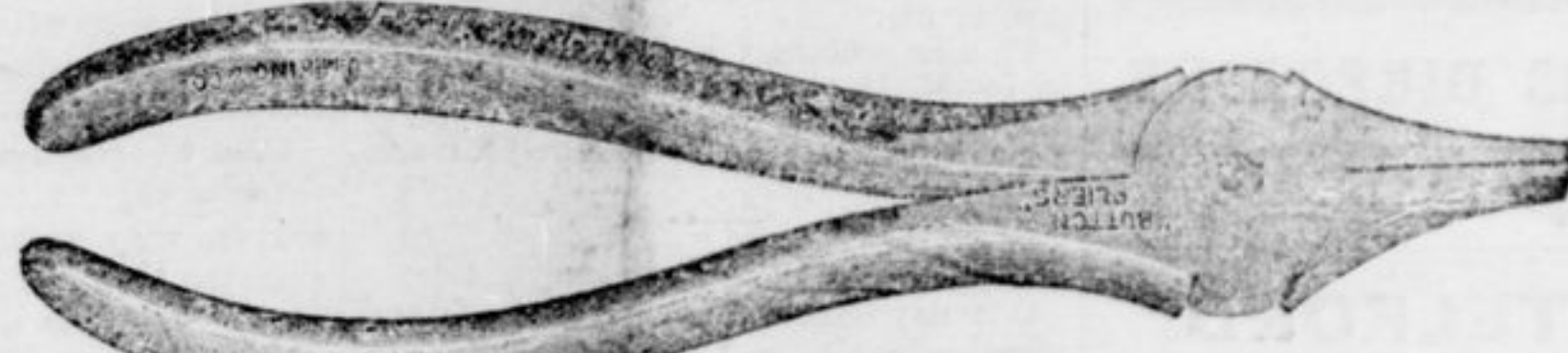
STEEL WIRE PINCHERS AND CUTTERS—ALL SIZES FROM 50c. UP. Pig Ringers and Rings—Plough Lines from 13 cents up.

Straw hats—wide rims—8 cents up. Cr s' Towelling (wide) Tuesday 5 cents a yard. 4 cent Sugar Syrup, Tuesday 2 cents a lb. New Bicycle tweeds—very stylish—from 25 cents to 40 cents a yard. Cycle Pant clips, Reg. 10 cents at 5 cents a pair.