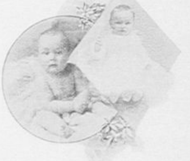
A PRECIOUS HAMPER

Page Ned and Betty sat in front of the fire after smiling lovingly at each other until it was quite certain that the little ones were sound asleep.