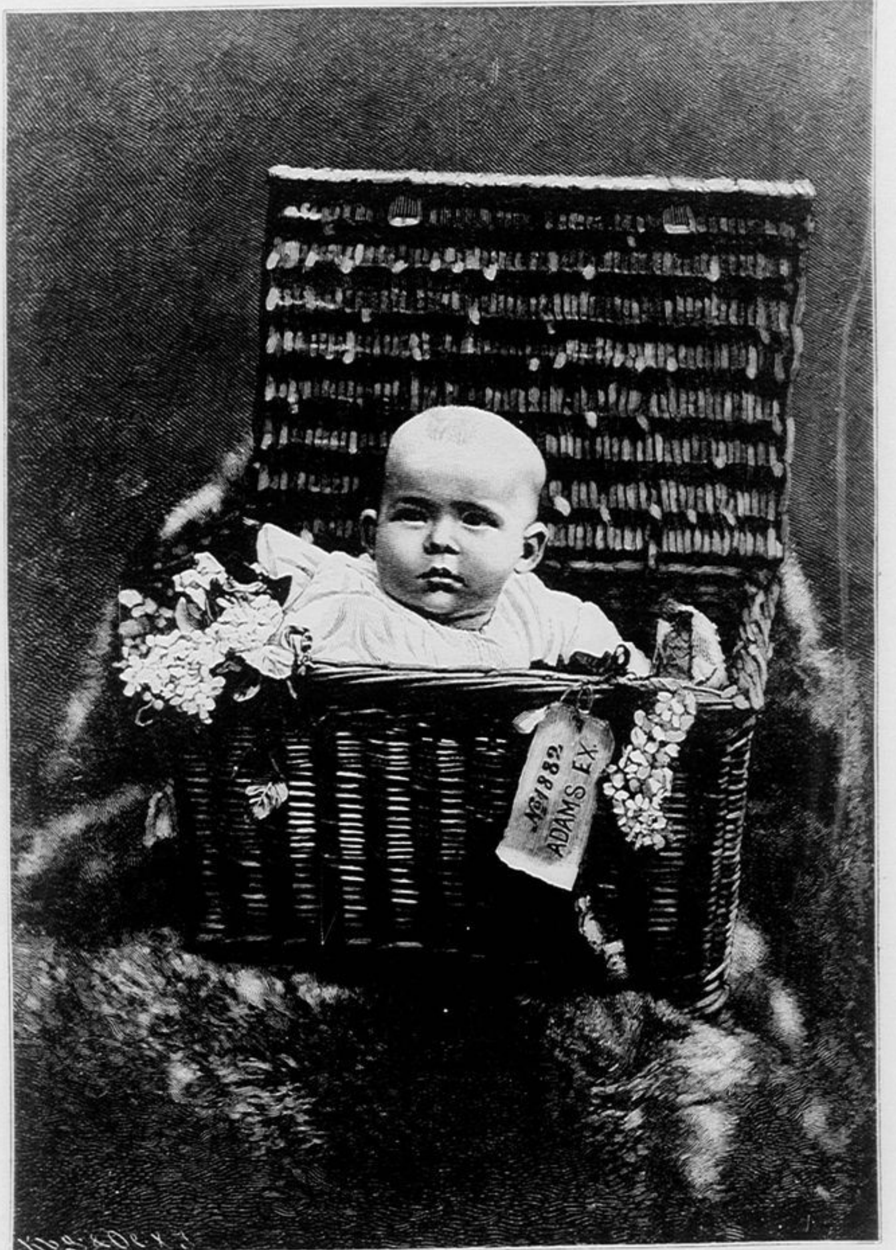
A PRECIOUS HAMPER

fell on his knees on the floor and began to search. Betty asked for no explanation. She put the hamper on the floor and searched too.