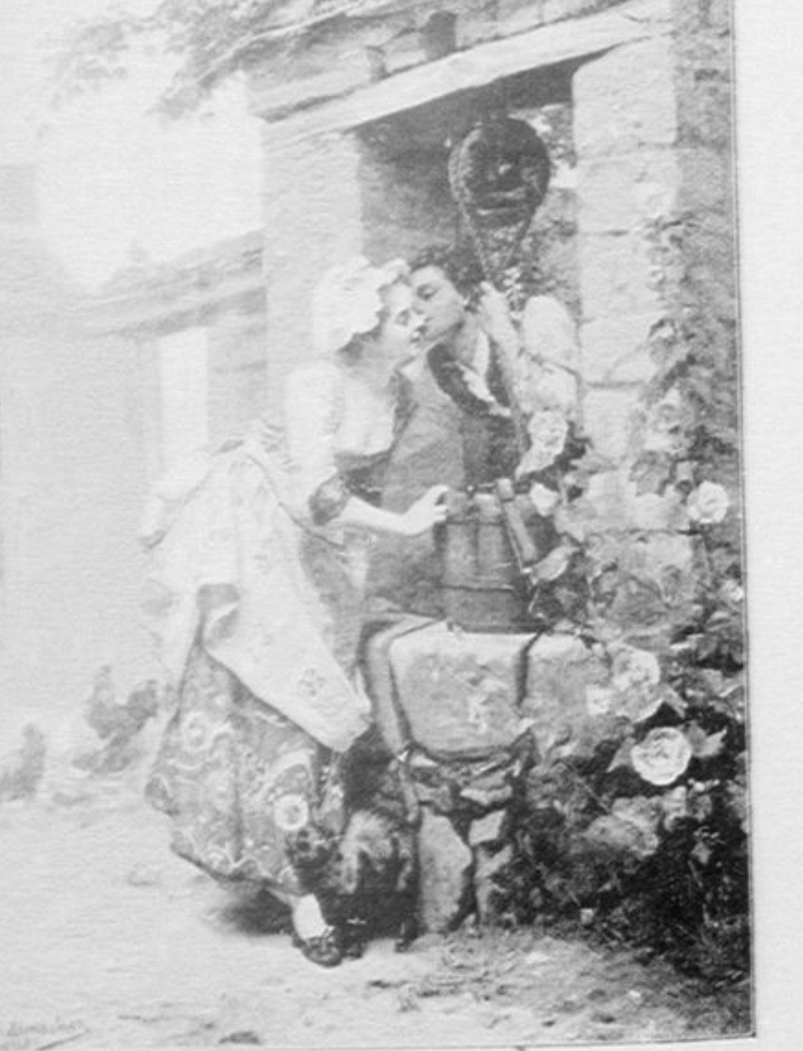
THE KISSING WELL.

fresh oysters at J. A. Hunter's, price at McKinnon's.