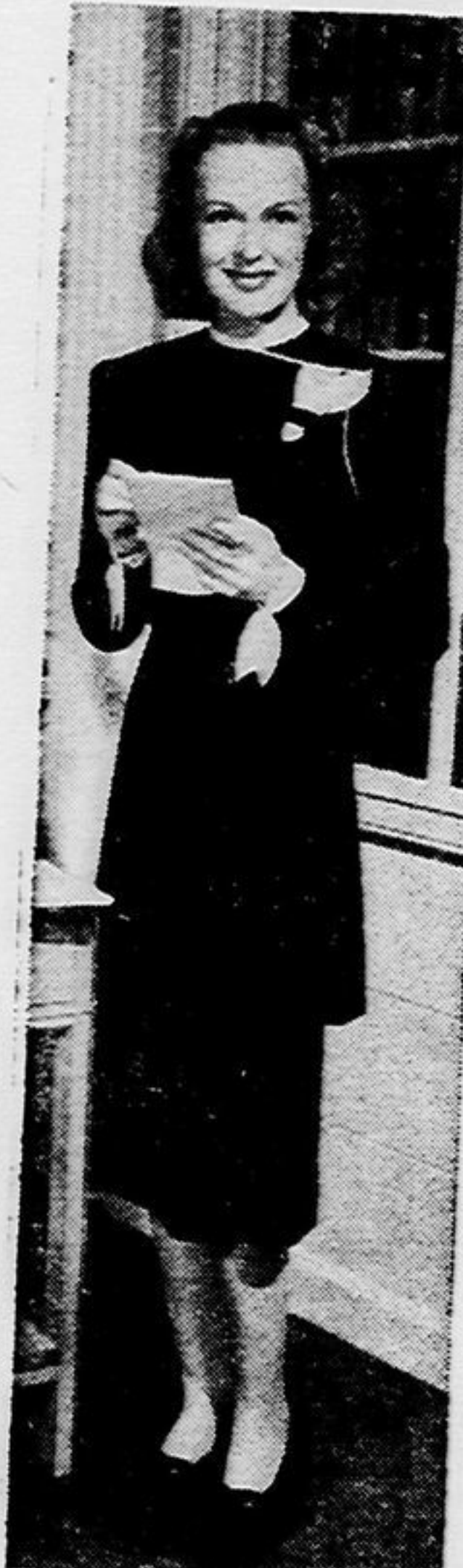
Rita Johnson wears a wardrobe especially designed for the working girl by Dolly Tree. On days when you are leaving the office to keep an important dinner date with your beau, try wearing a black crepe dress instead of your suit. It isn't too dressy for office wear if cut on simple lines such as this one worn by the actress. The tunic is belted over a straight skirt and once again crisp pique is used for trimming. Now this is another "two faced" dress because it too may be changed by discarding the pique trim or changing it around.