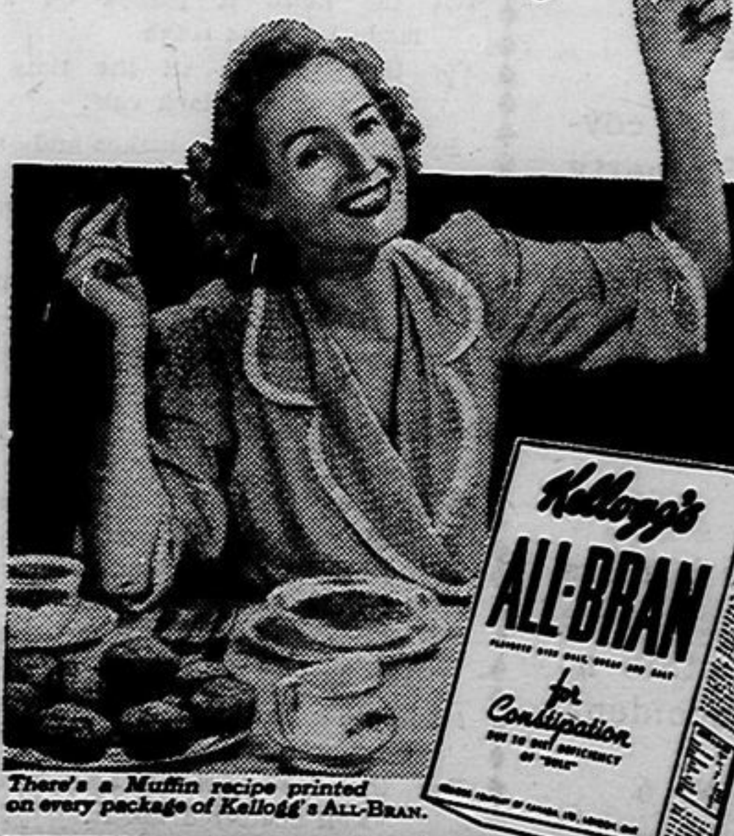
There's a Muffin recipe printed on every package of Kellogg's ALL-BRAN.

For Breakfast — Eat KELLOGG'S ALL-BRAN in Golden-Brown Muffins or as a Flavourful Cereal