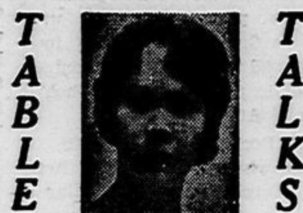
By SADIE B. CHAMBERS