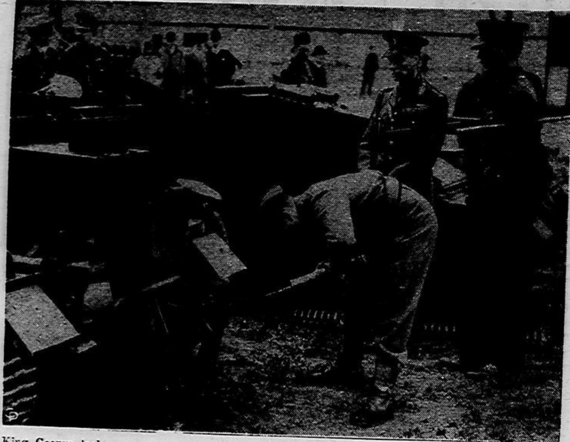
King George looks on as a recruit does maintenance work on a Bren gun carrier. The King inspected the camp of the Royal Fusiliers, situated near the London area, recently. The men attached to this division have had only a few weeks training, but are ready for any eventuality.