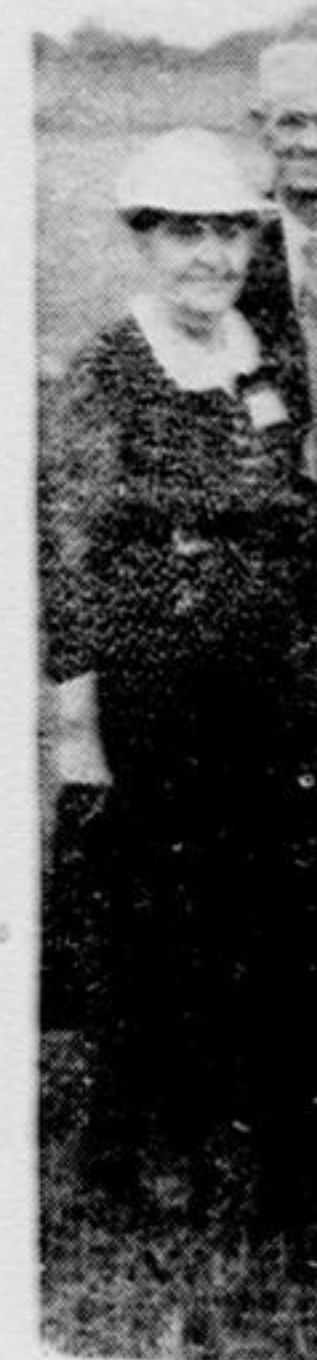
Shown in the above pic at the Reunion held at the Front row, left to right— Second row, left to right— Back row, left to right—