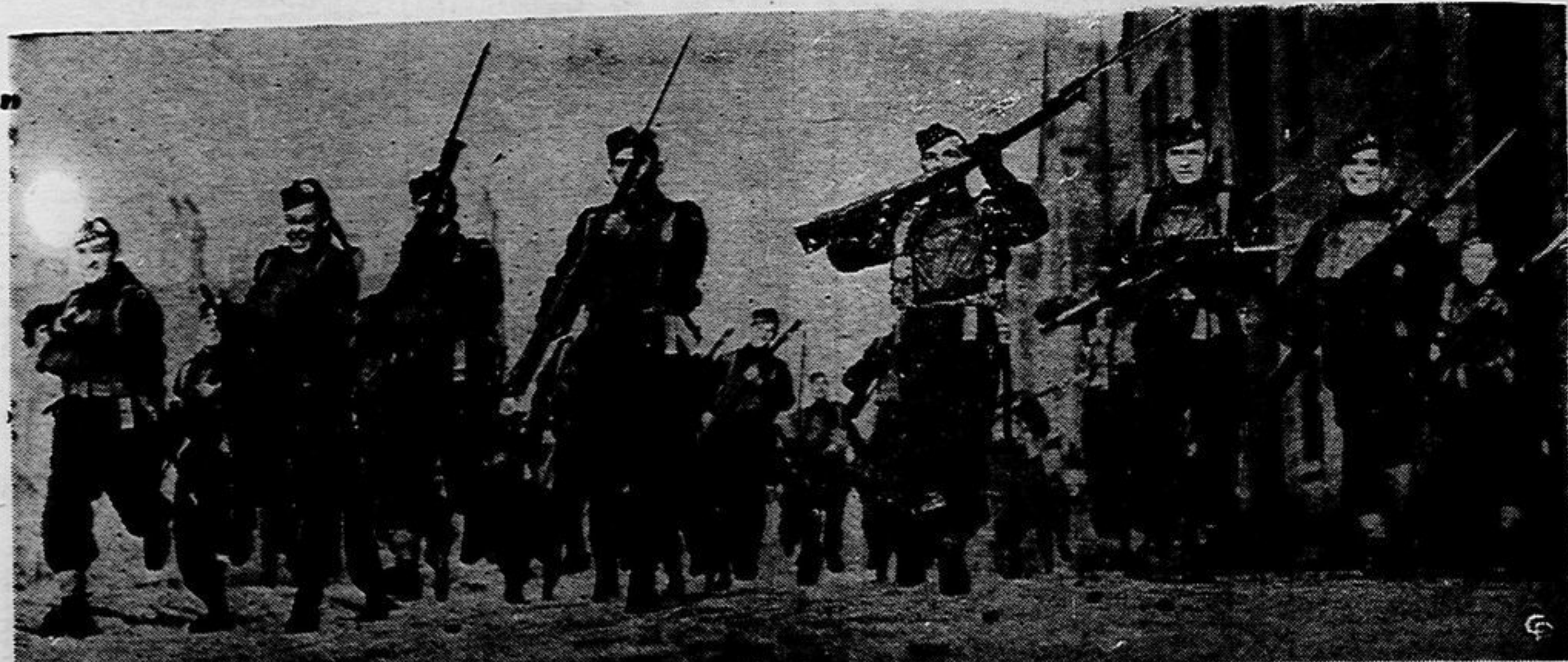
Undergoing extensive training in the various phases of modern warfare, men of the First Division of the C.A.S.F. are rapidly being whipped into readiness for the time when they may be needed for action in France. Scottish troops from Canada are shown here putting on a very realistic exhibition as they engage in field bayonet practice at their training camp in England. As in the last war, the Canadian troops will maintain their identity as fighting units during their training period and later in the field.