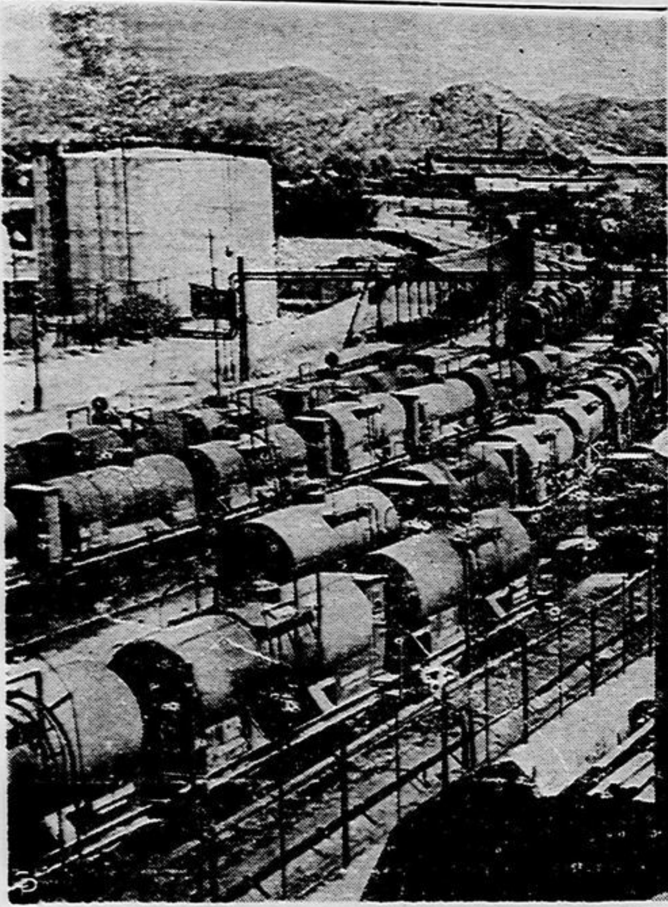
A view of a railway yard beside one of the many oil refineries in Rumania is seen above. The oil is piped down to the large tanks from the wells in the hills (background) and refined and pumped into the tank cars on the sidings. Rumania has ordered her already large military preparations speeded up, following authoritative reports that Germany was challenging the government's ban on export of aviation gasoline to the Reich.