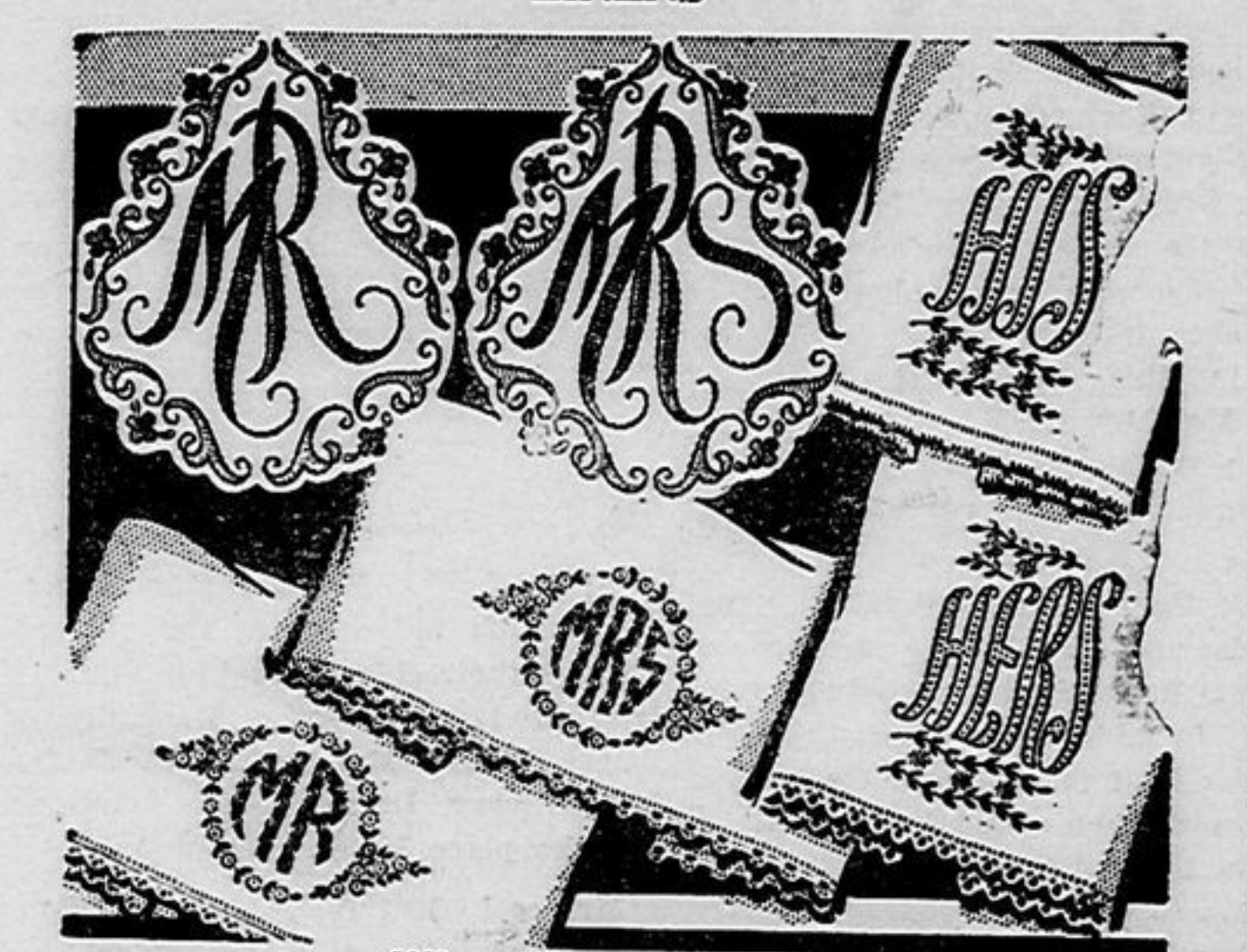
EVERYONE'S FAVORITE, THESE MODERN, EASY-TO-DO DESIGNS. EMBROIDERED THEM ON PILLOW CASES AND LET YOUR NEEDLEWORK SCORE A HIT.

Everyone's favorite, these modern, easy-to-do designs. Embroider them on pillow cases and let your needlework score a hit.