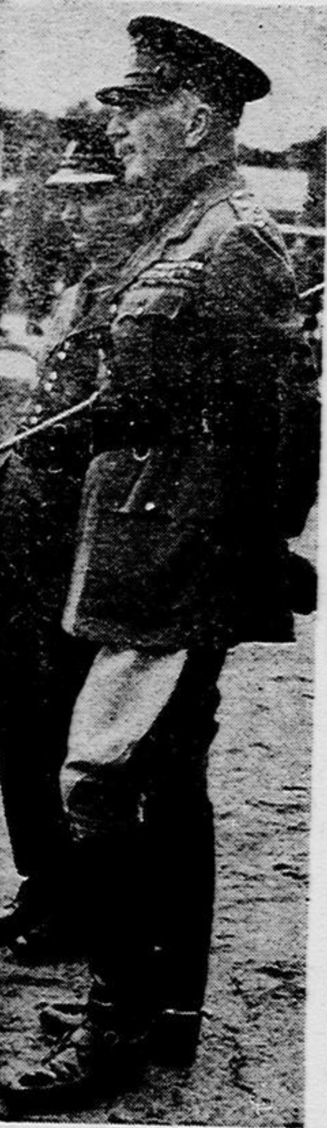
The Earl of Athlone, Canada's new governor-general, is shown chatting with Lieut.-Col. W. G. Wurtele during an inspection in Ottawa of the Governor-General's Foot Guards.