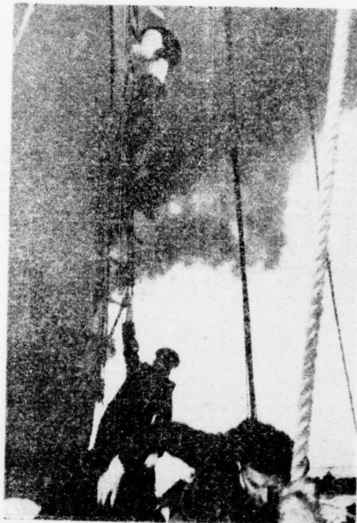
In this dramatic picture, sailors of the German luxury liner Columbus are shown going over the side of the blazing liner into waiting lifeboats after her captain ordered her scuttled rather than let the craft fall into the hands of the Royal Navy.