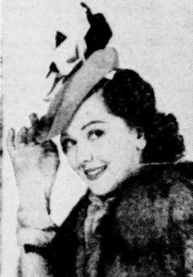
Ann Rutherford chooses a grey felt to match her bubble crepe dress of the same shade. Folds of pink and brown velvet ribbon cluster at the back and hold the hat on with ribbons tying under her curls.