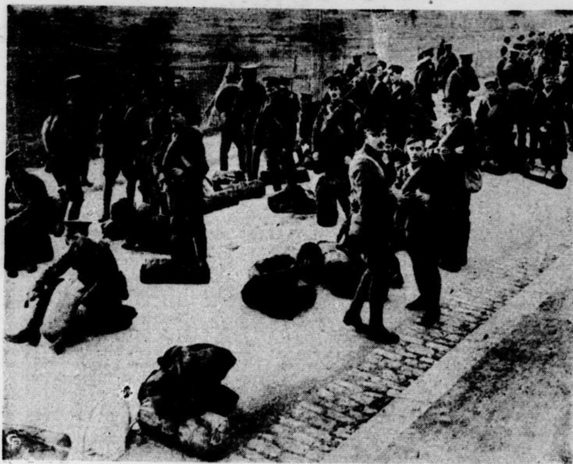
Just 25 years ago Oct. 8, the first Canadian troops landed at Plymouth, England, anxious to do their part to help the empire emerge victorious in the conflict of 1914-18.