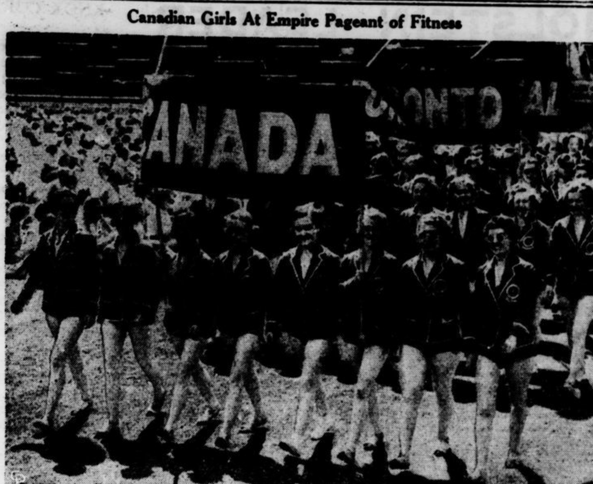
Girls of the Canadian contingent are pictured during the mass rehearsal which preceded the recent empire pageant of physical fitness, held in London, England. Delegates from all parts of the empire participated in the rally.

"CANADA 1939" The Dominion Bureau of Statistics has recently issued the 1939 edition of its Official Handbook, "Canada" in which the review of the country's economic progress and organization is brought up to date. It's a compendium of information useful alike to business people and the general public. Production, trade, finance, labour and transportation, in addition to such subjects as population, health and education receive detailed treatment. This year a special article following the Introduction deals with the Unemployed Youth Problems... Steps Toward Its Solution. There is a limited number of the copies of the Handbook still available, at twenty-five cents apiece. Applications for the book should be addressed to the King's Printer, at Government Printing Bureau, in Ottawa.