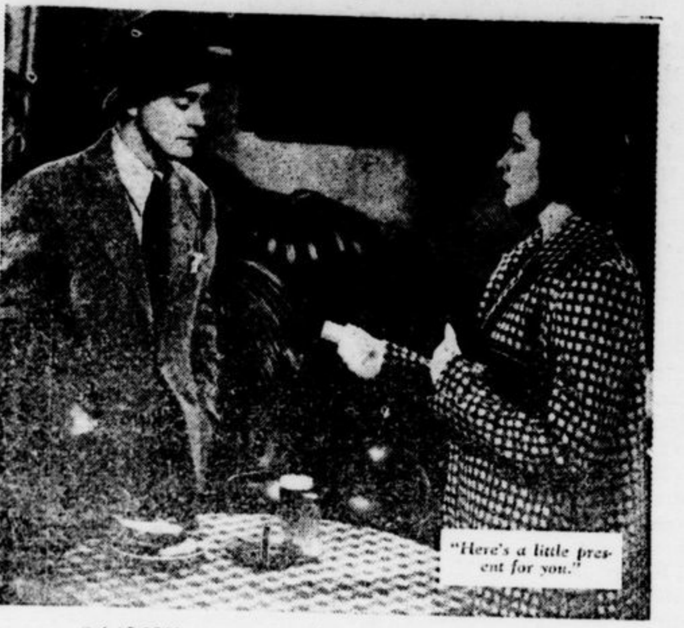
"Here's a little present for you."

Dr. Gillespie, cantankerous diagnostician chief of the Blair General Hospital, fires young Dr. James Kildare from the post of his assistant and assigns him to duty in a field dispensary.