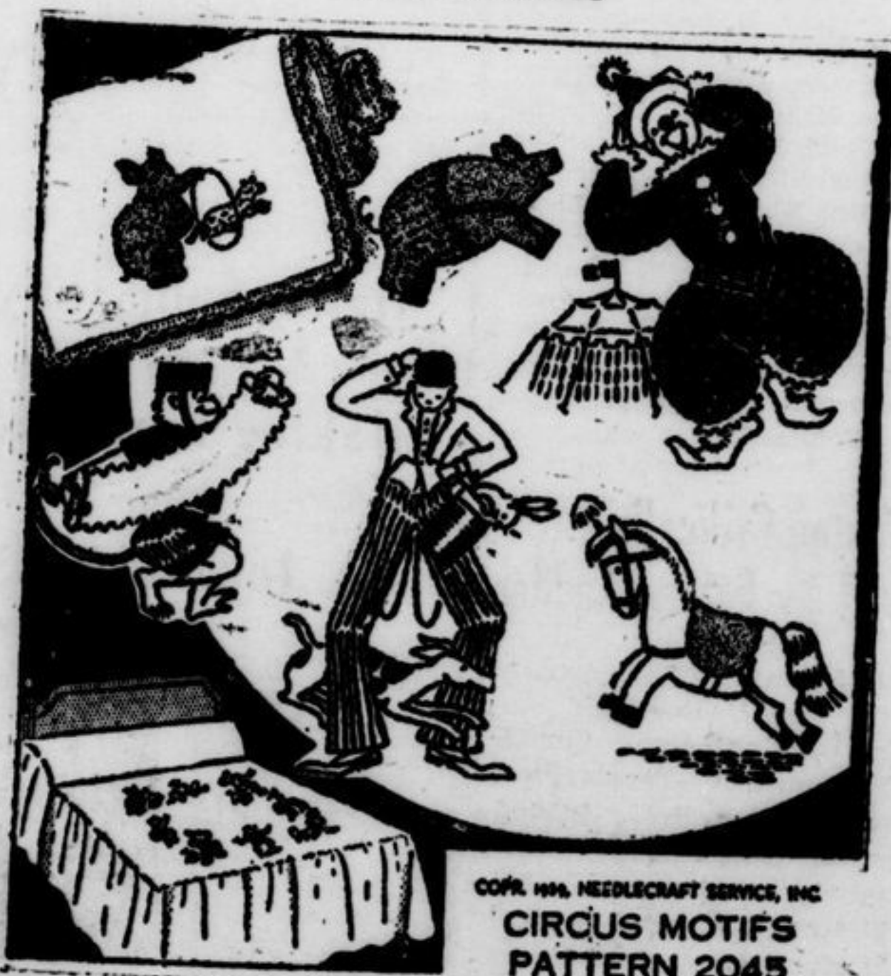
COPYING PERMISSIONS: SERVICE, INC. CIRCUS MOTIFS PATTERN 2045

These rollicking circus folk, some in plain stitchery, some in applique, will decorate many juvenile accessories, to every youngster's delight. Pattern 2045 contains a transfer pattern of 11 motifs ranging from 8 1/2 x 12 inches to 2 x 3 inches; applique pattern pieces; illustrations of Send twenty cents in coins (stamps cannot be accepted) for this pattern to Wilson Needlecraft Dept., 73 West Adelaide St., Toronto. Write plainly Pattern Number, your Name and Address.