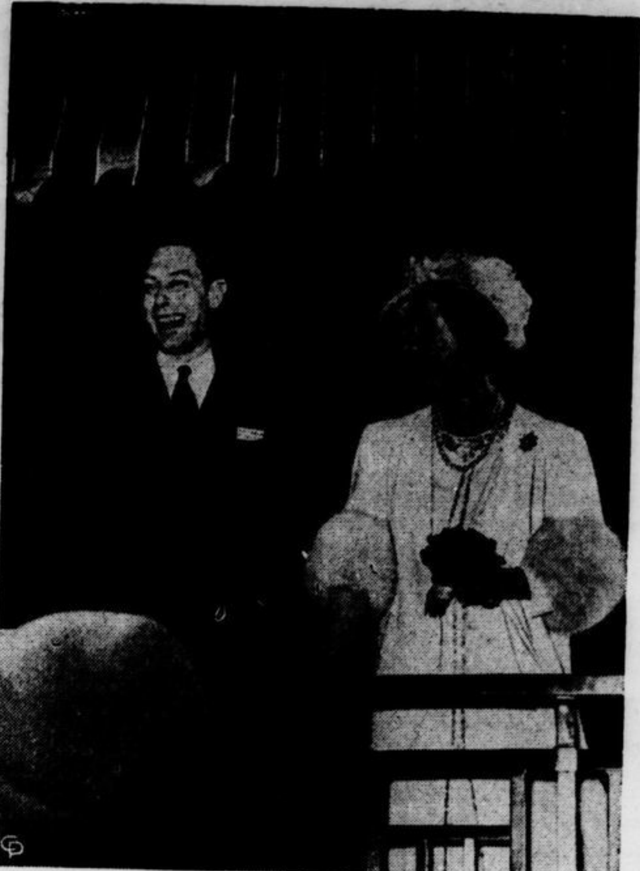
En route from Ottawa to Toronto, with a short stop at Kingston, the King and Queen are seen as they stepped out on to the balcony of their observation car as the royal train slowed, while passing through Brockville, where the residents were massed for their short greeting.

outward pressure very often tightened the inward hands, and where mutual confidence diffused continual joy.