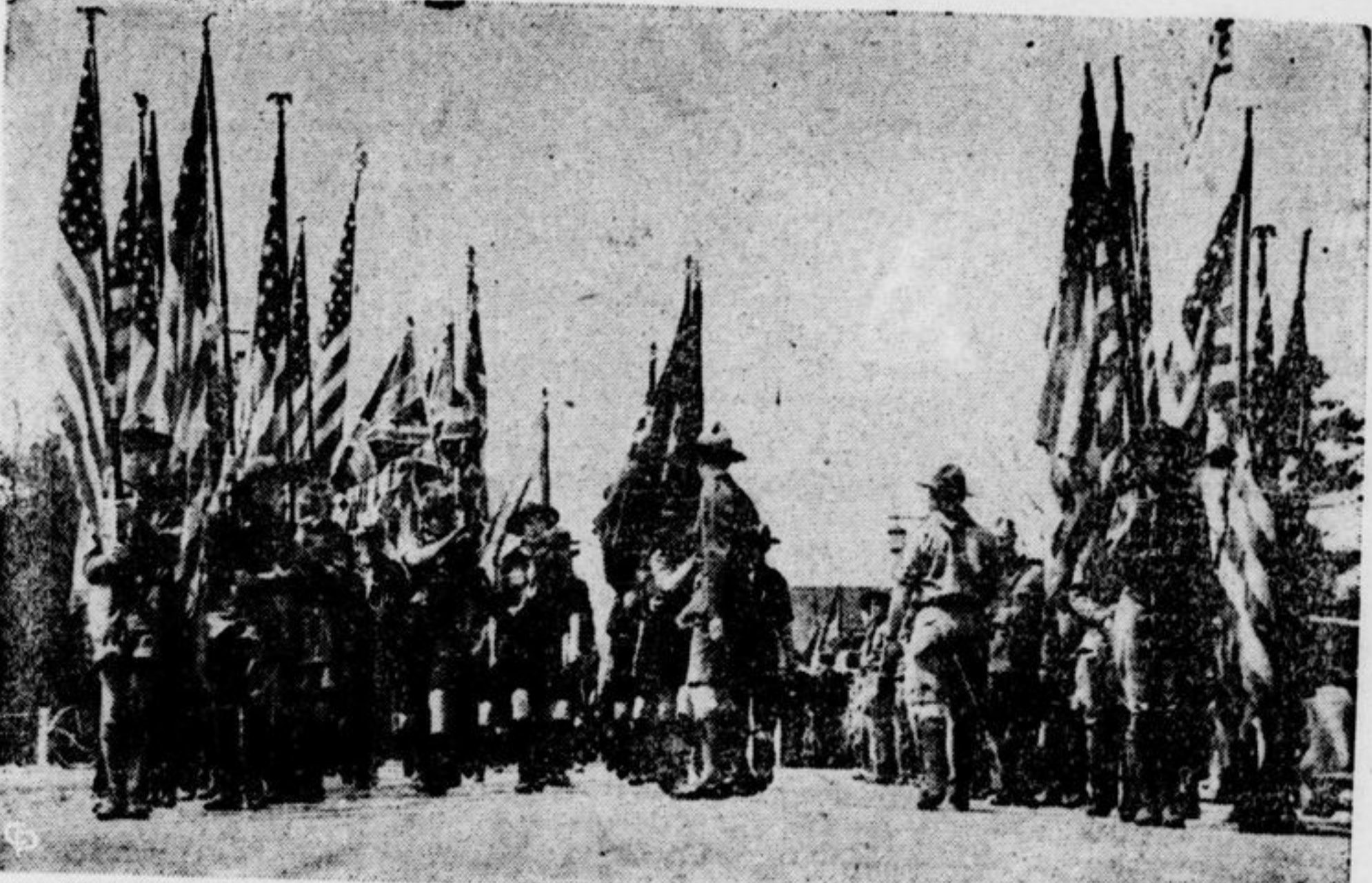
Taking part in celebrations to commemorate the King's birthday, Canadian Boy Scouts are shown crossing the International Bridge at Alexandria, N.Y., to plant a George Washington black walnut tree and a Canadian maple tree on American soil. A large group of American Scouts did the same on Canadian soil.

Have You Heard? And so it happened, while his eyes were filling with woe and sadness His little tail went wagging on Because of previous gladness.