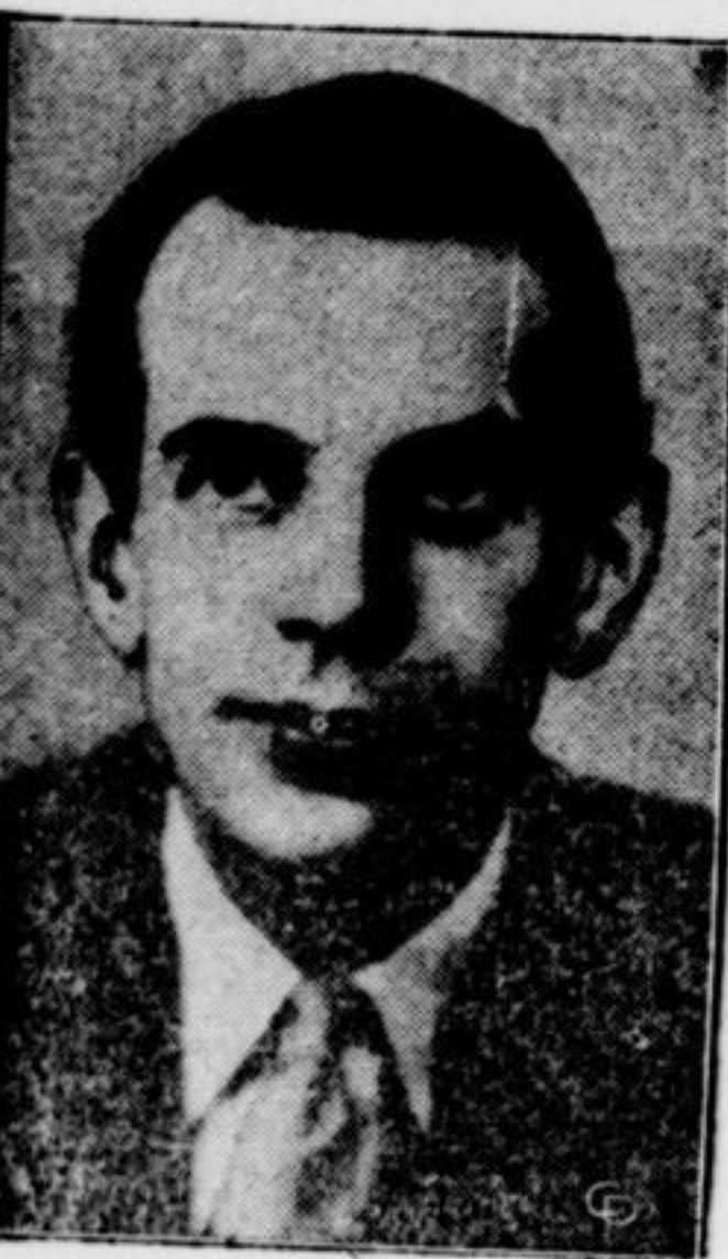
Raymond Massey, distinguished Canadian actor who is making such a hit on the New York stage as Abe Lincoln in "Abe Lincoln in Illinois" flew to Toronto today to be present at the luncheon in Hart House given for Their Majesties.