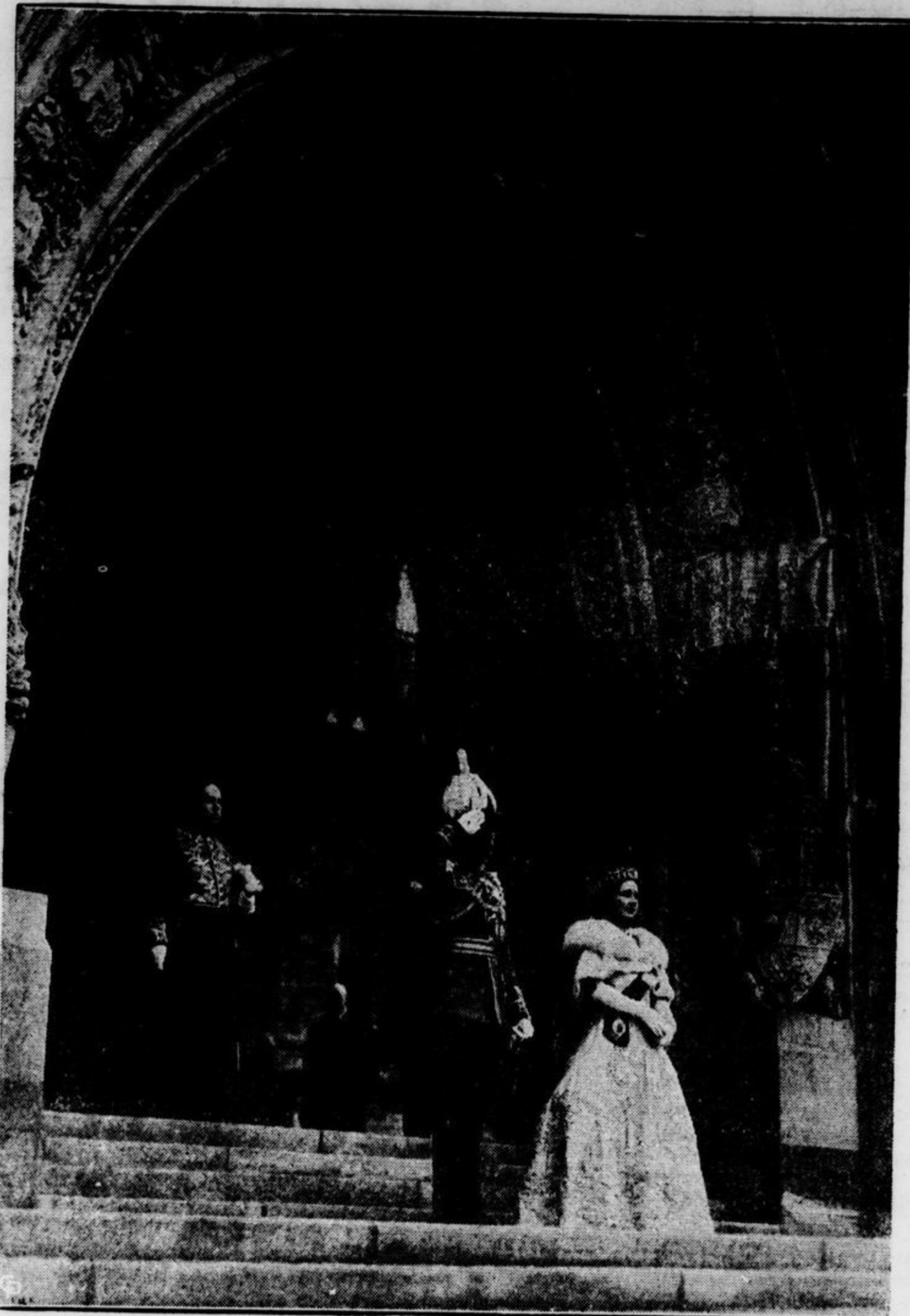
Framed in the doorway of the dominion Parliament Buildings at Ottawa, following the solemnly historic ritual within, the King and Queen make a magnificent picture, as the Queen, charmingly dignified, stands at His Majesty's side as he takes the salute during the martial ceremony which followed that in the Senate. Prime Minister Mackenzie King stands farther back in the arched doorway.