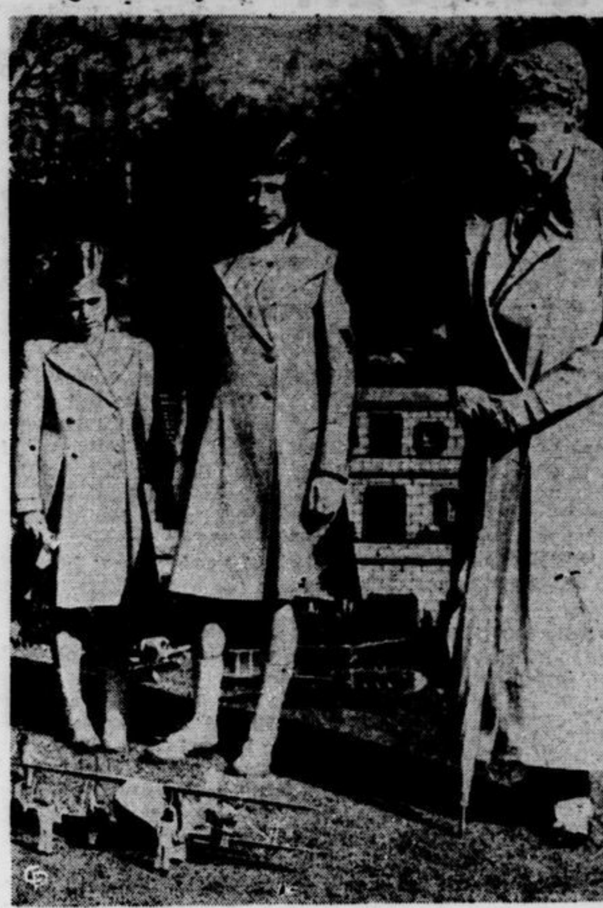
Taking charge of Princess Elizabeth, CENTRE, and Princess Margaret Rose during the absence of their royal parents in Canada, Queen Mary is shown here with her grandchildren at the miniature airport of the miniature village at Beaconsfield, Bucks, England.