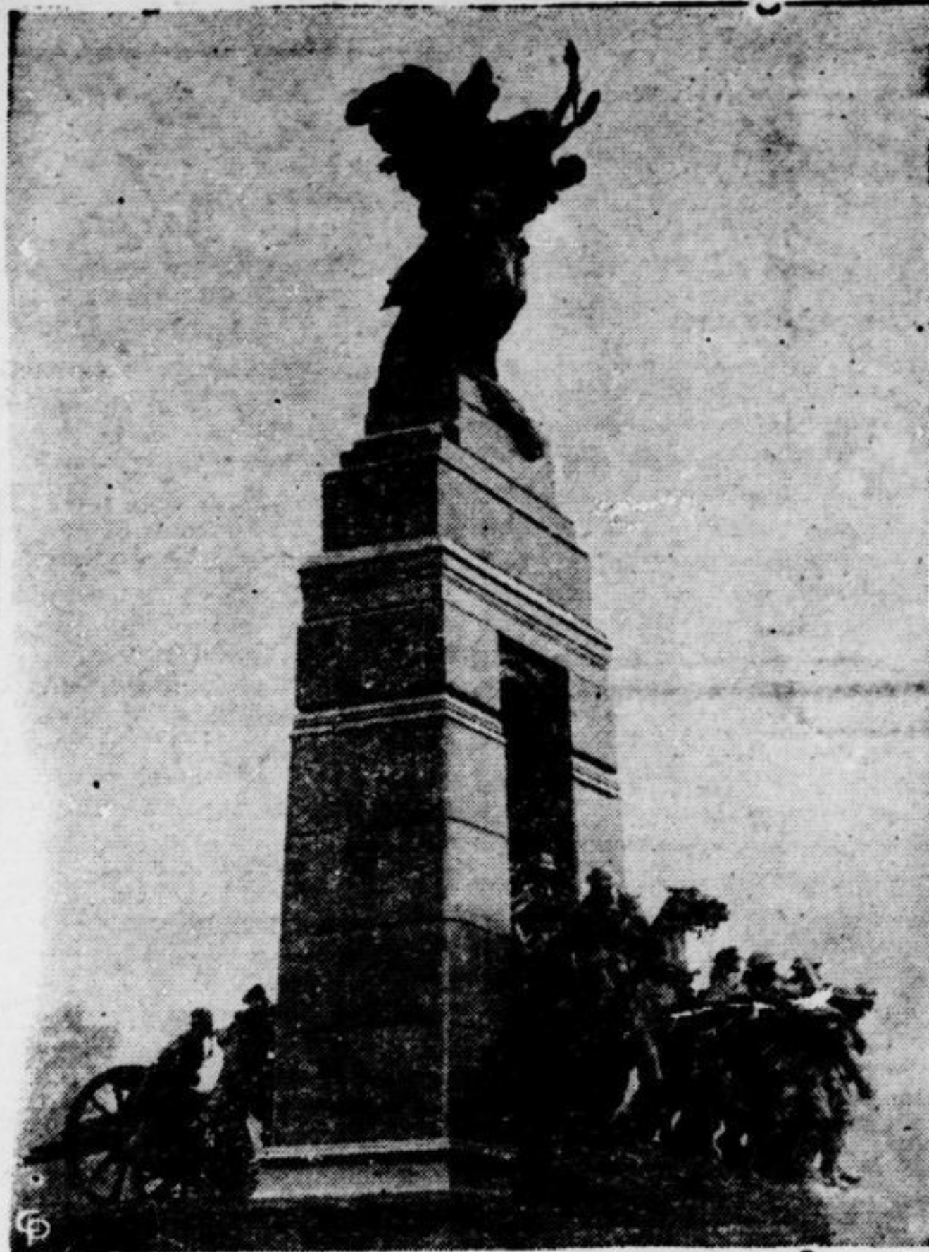
THE NATIONAL WAR MEMORIAL, OTTAWA

The Review to New Subscribers to Jan. 1, 1940, only $1.00