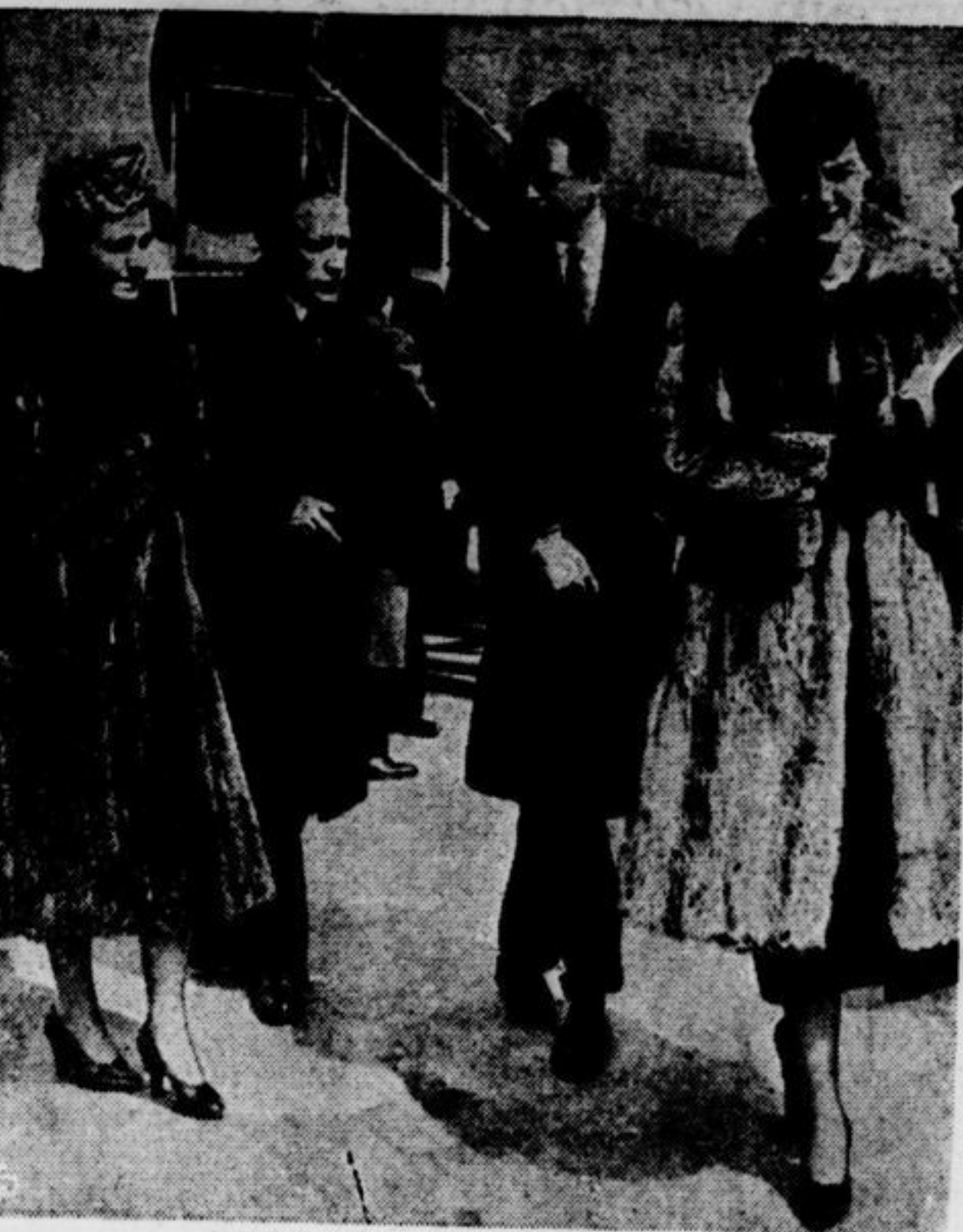
The Duke and Duchess of Kent, RIGHT, were greeted by British Ambassador Sir Eric Phipps, LEFT, and Lady Phipps, as the Duke and Duchess arrived at Le Bourget airport for a short visit in Paris, while en route to Australia, where the Duke will assume his duties as Governor-General.

ven, "heirs of God, and joint-heirs with Jesus Christ" (Rom. 8:17).