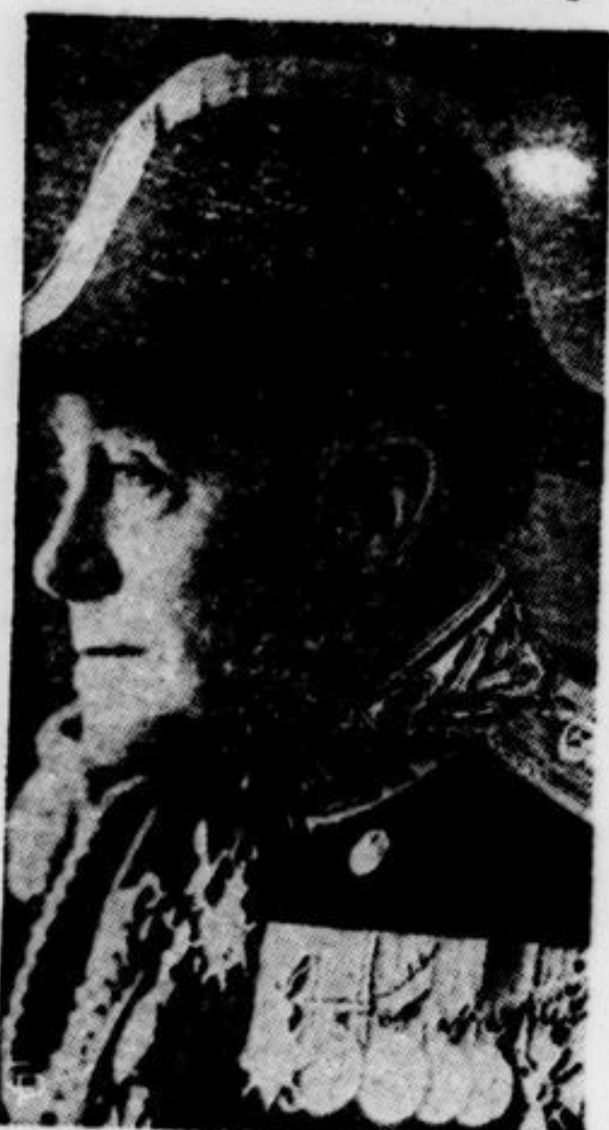
Admiral Sir Dudley North will command the Canadian liner Empress of Australia which has been commissioned as a "royal yacht" to carry the King and Queen to Canada.