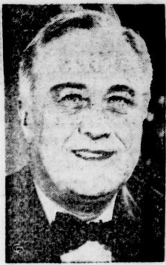
President Franklin D. Roosevelt of the United States who has repeatedly and fearlessly spoken out against the actions of aggressor nations.