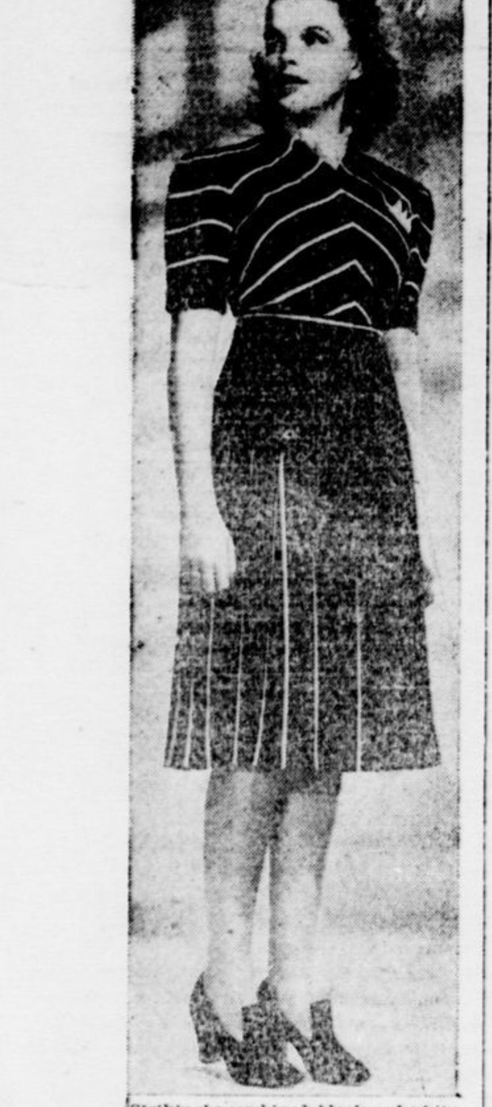
Strikingly combined, black and white wool is featured in Judy Garland's afternoon frock.

Use a soft brush, hot water and a bland soda to wash fine china with an intricate, raised motif. Kincro thoroughly in clear hot water and dry carefully with a soft towel.