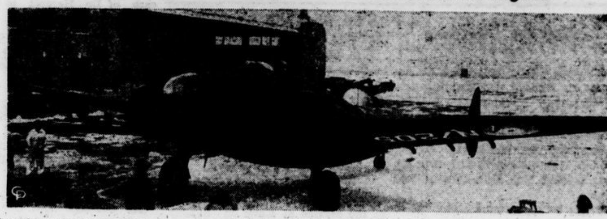
This twin-motored bomber shown as it arrived from California at Floyd Bennett airfield in New York is the first of 250 ordered by Great Britain for the Royal Air Force. The machine is a Lockheed 14, powered by two 1,100-horsepower engines and with a cruising speed of over 200 miles per hour. The bomber will be dismantled and shipped to England by boat. It is understood that Britain intends to use the American built machines for long-distance reconnaissance work.