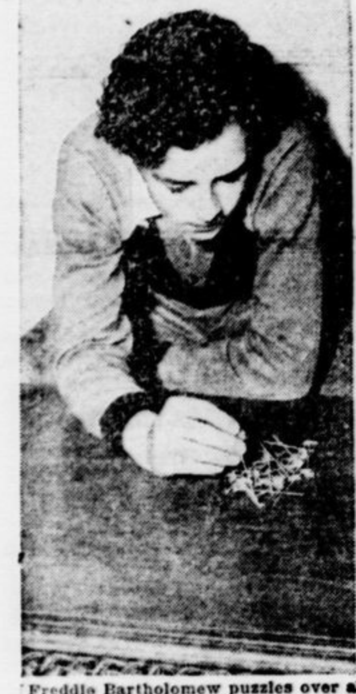
Fredrick Bartholomew puzzles over a game of Jack straws during his leisure moments at the studios.