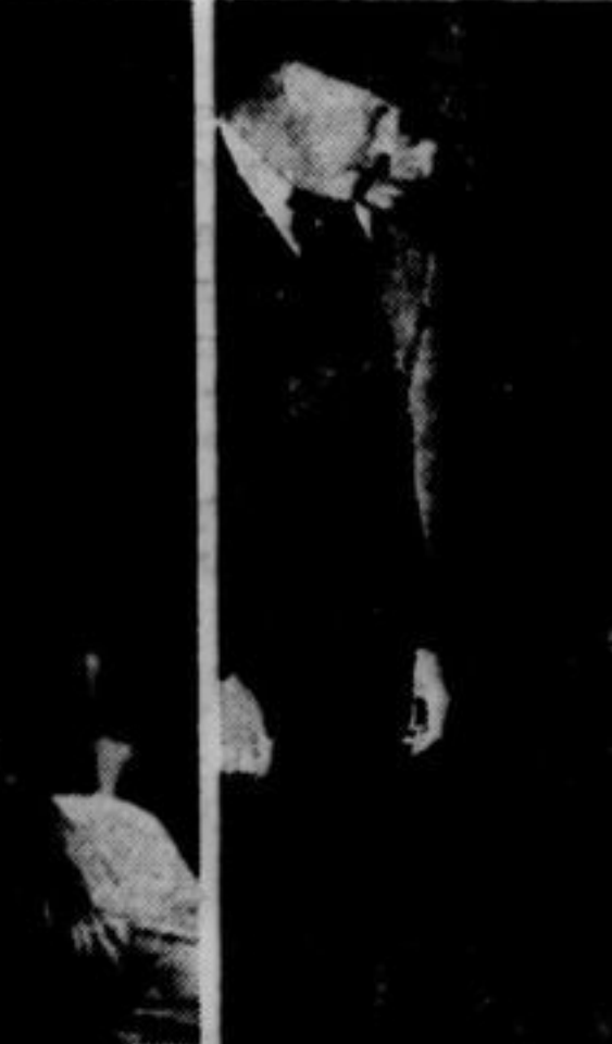
Whitey is walking about aimlessly in the night. Suddenly, he hears a noise. A bank is being held up. The bandits dart out of the building and to Whitey's amusement, one of them is his older brother Joe. He calls out and suddenly one of the other gangsters fires. Whitey falls to the ground, a bullet in his leg. Don't miss reading the powerful concluding episode.

Registration figures at University of Saskatchewan this year topped the 1937 total by nearly 100. Students this year total 1,230, compared with 1,143 a year ago.