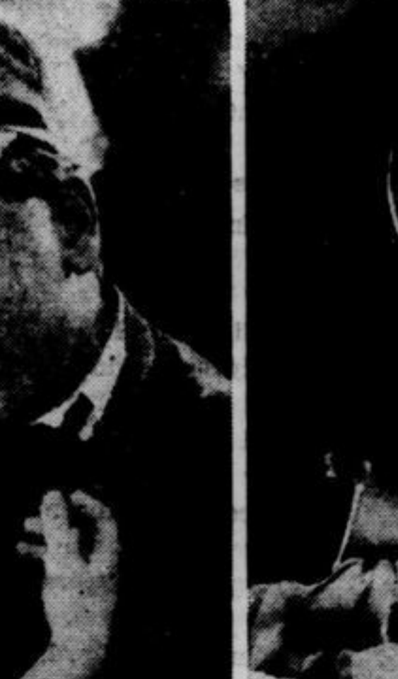
"Pee-wee, lad, I'll keep the candy on tap."