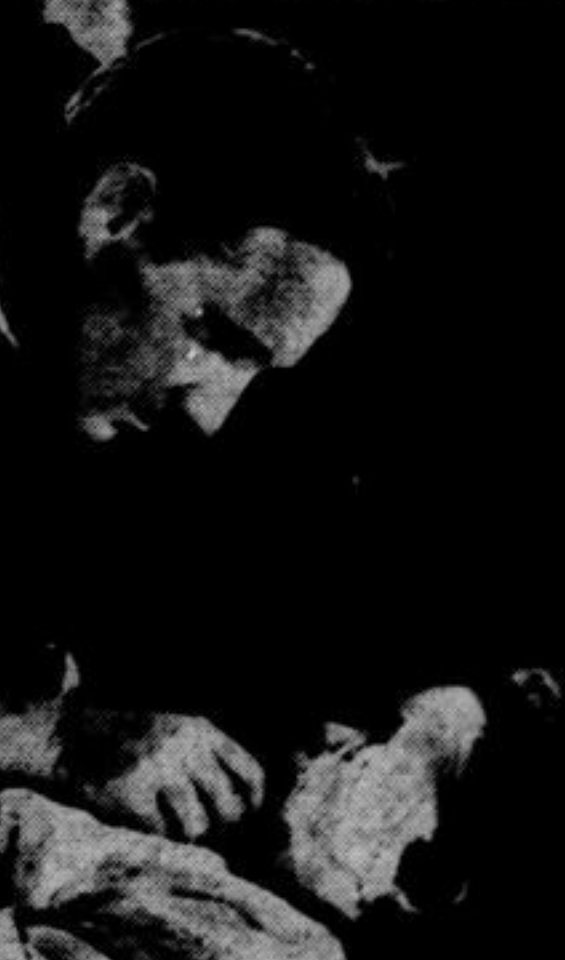
"Listen kid. Remember. No squawkin'!"