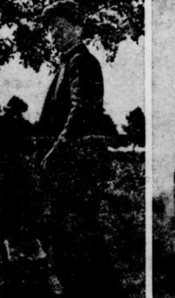
"A lousy joint."