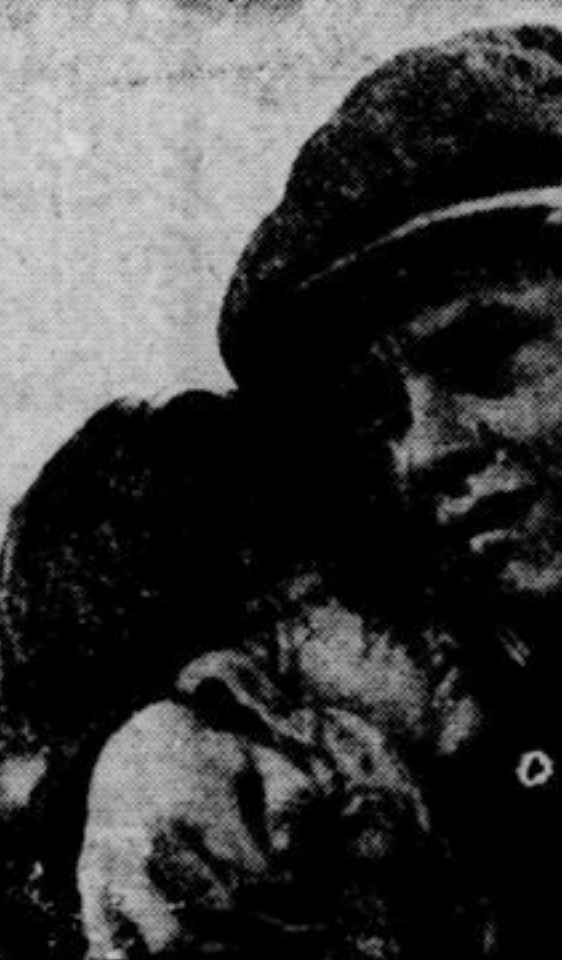
"I didn't mean it. Say something, Pee-wee."