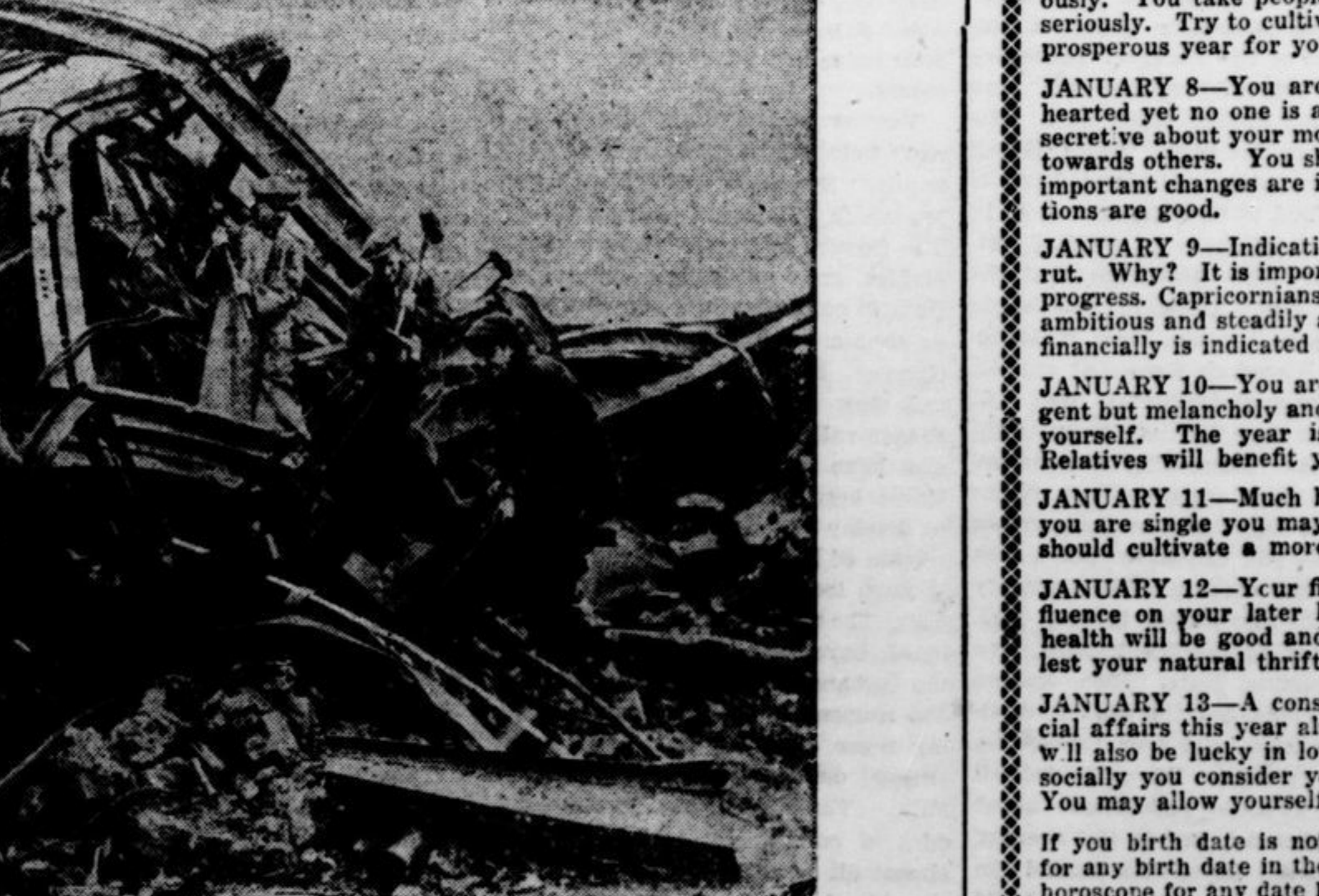
Workmen are still breaking up the metallic wreckage of the famed Crystal Palace in London, England, 13 months after it burned down.