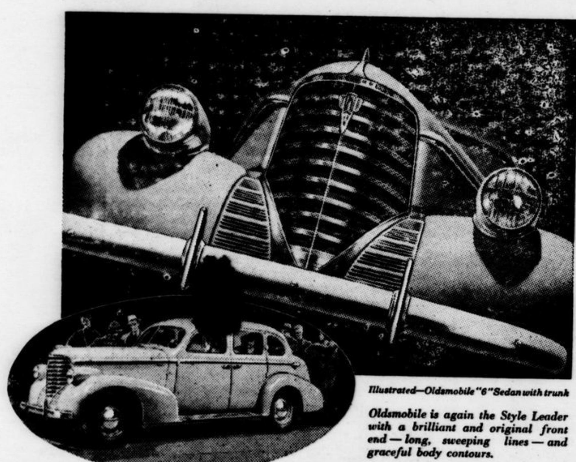
Oldsmobile is again the Style Leader with a brilliant and original front end—long, sweeping lines—and graceful body contours.