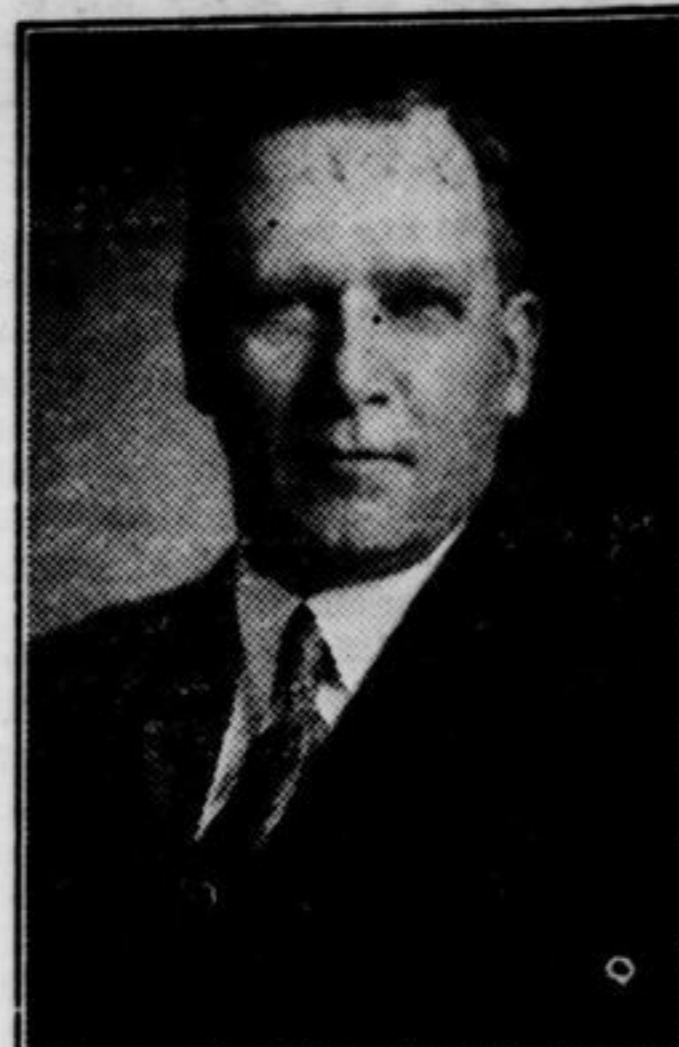
HON. DR. L. J. SIMPSON Minister of Education in the Hepburn Government, who is being opposed by Hon. Earl Rowe, Conservative leader, in the riding of Centre Simcoe. It is one of the hottest battles of the campaign, and Dr. Simpson stands a good chance of re-election.

Farm for sale, 4 1/2 miles north of Durham: good buildings; running water; nearly 200 acres, some bush. For sale cheap. Apply to Albert Middleton, Durham.