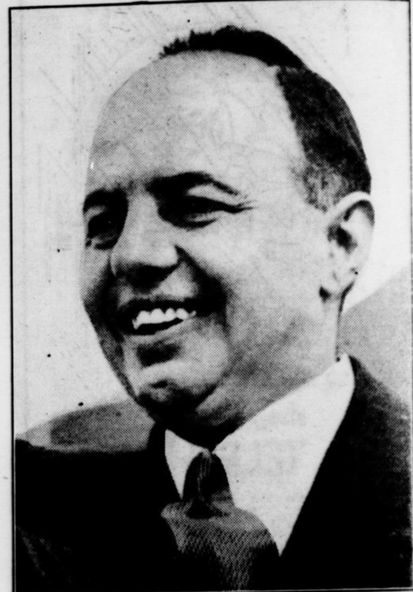
HON. MITCHELL F. HEPBURN Premier of Ontario, whose Government, it is generally anticipated, will be returned to power next Wednesday.