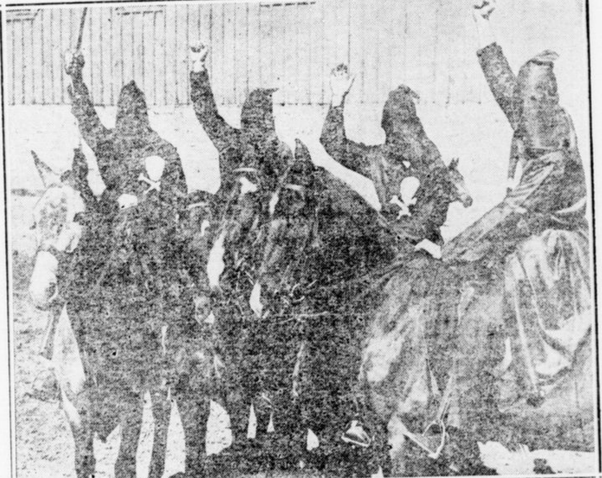
These mancebe "Four Horsemen" helped drive home the dangers of reckless motoring as they rode in front of the "Horror Parade," staged at Atlanta, Ga., by Junior Chamber of Commerce to depict the frightful toll taken in automobile accidents.