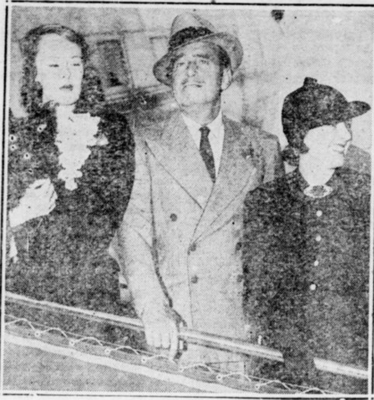
Douglas Fairbanks, his wife (left) and Benita Hume, British actress, boarding plane at Los Angeles for flight to New York, where Fairbanks conferred with Gary Cooper, who will star in first film of Fairbanks' new venture as a movie producer.