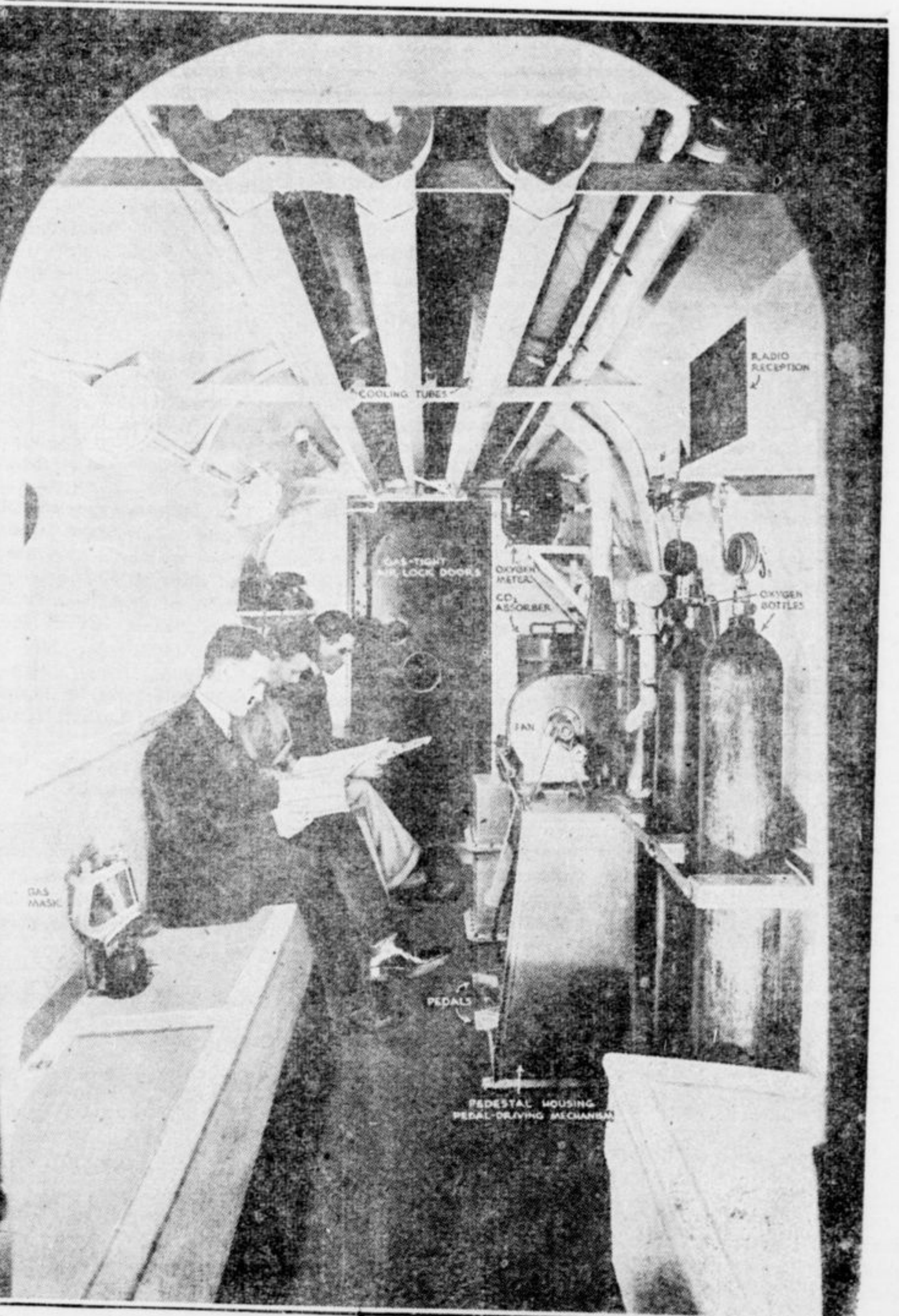
London already has one office building equipped with a cellar stated to be proof against infiltration of poison gas. The place has air locks and is so devised that gas filled air is filtered through a special device for ten persons in the chamber. The fans are motor driven but should the power be cut off there is a contraption which will drive them by foot power. Radio and first aid apparatus are installed, and water. London also has a four-storey building fitted with a filtration plant and iron-shuttered windows so that the staff can carry on during a gas raid fully protected against explosions without.