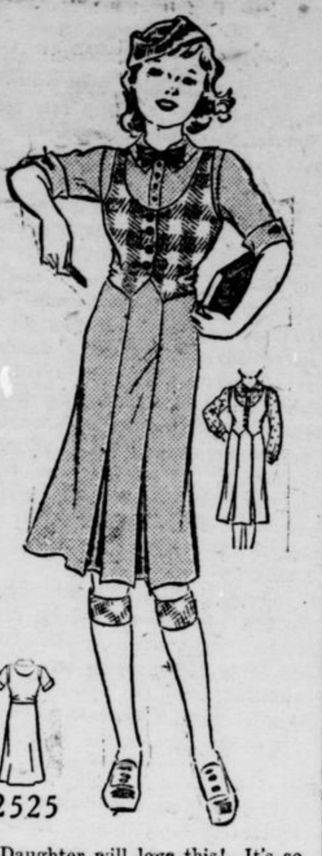
Daughter will love this! It's so new looking in green woolen. The Scotch plaid bodice in green and brown that gives the effect of a jacket, is really sewed to the skirt. The blouse is separate.

See small view! Another idea with jumper all in one material and with contrasting blouse.