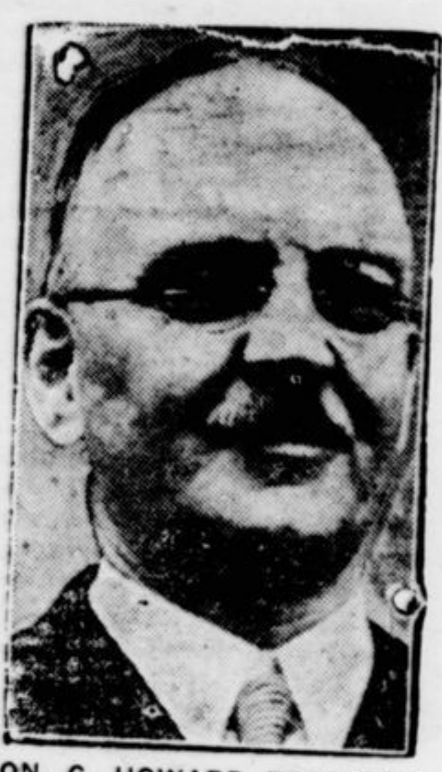
HON. G. HOWARD FERGUSON Who will shortly return to Canada from London, England, where he has served the past five years as Canadian High Commissioner.