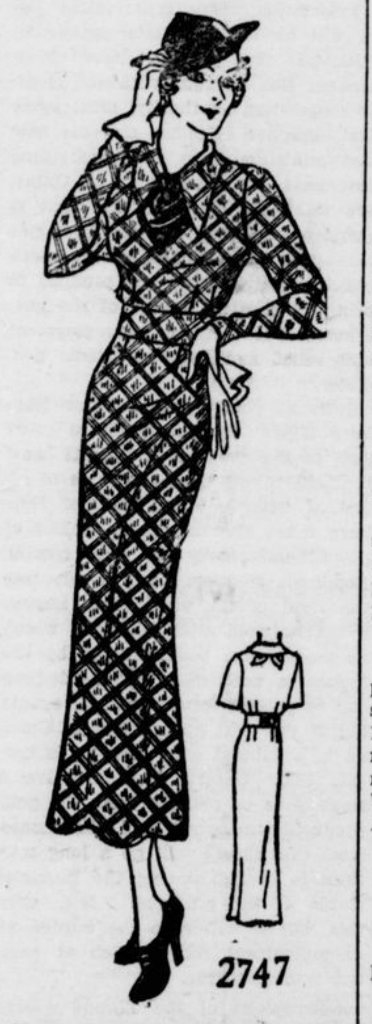
Here is a dress that will appeal to amateur and expert sewer alike. It's so easily made, being a one-piece affair, which means practically only side and shoulder seams

Illustrated Dressmaking Lesson Furnished With Every Pattern