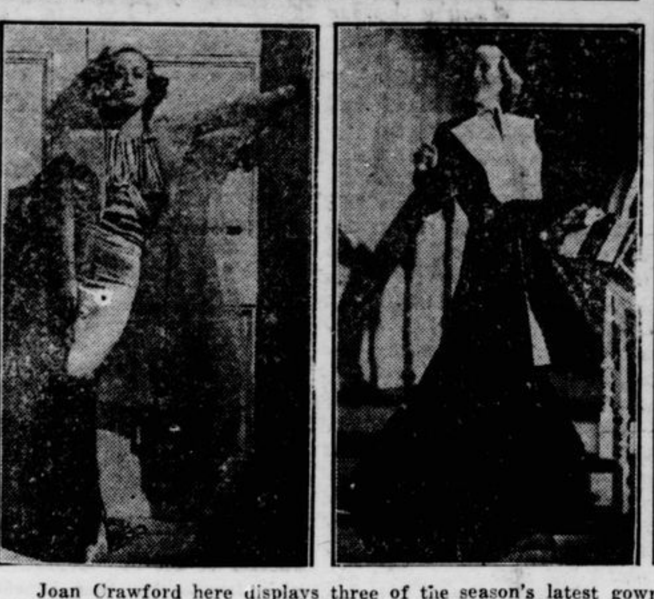
Joan Crawford here displays three of the season's latest gowns, chief feature of which is the new neck treatment.

LESSON VII.—February 17.—Peter Teaches Good Citizenship (Temperance Lesson)—I, Peter 2: 11-17; 4: 15. Golden Text—Love worketh no ill to his neighbor; love therefore is the fulfillment of the law.—Romans 13: 10.