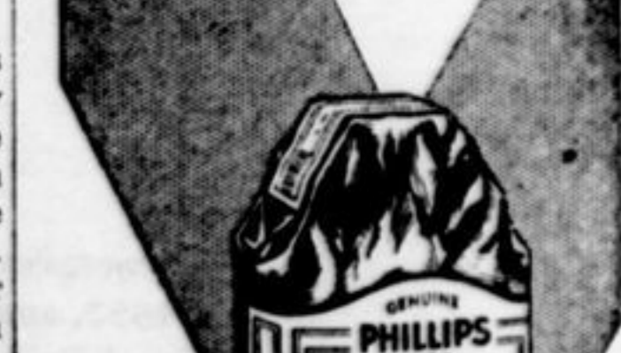
PHILLIPS' MILK OF MAGNESIA For Troubles due to ACID INDIGESTION ACID STOMACH HEARTBURN HEADACHE GASES-NAUSEA

EXCESS acid is the common cause of indigestion. It results in pain and sourness about two hours after eating. The quick corrective is an alkali which neutralizes acid. The best corrective is Phillips' Milk of Magnesia. It has remained standard with physicians in the 50 years since its invention.