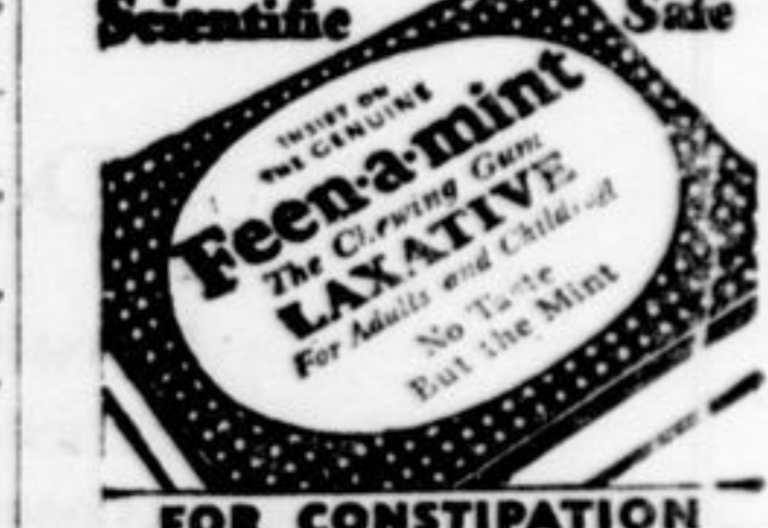
FOR CONSTIPATION Feen-a-mint