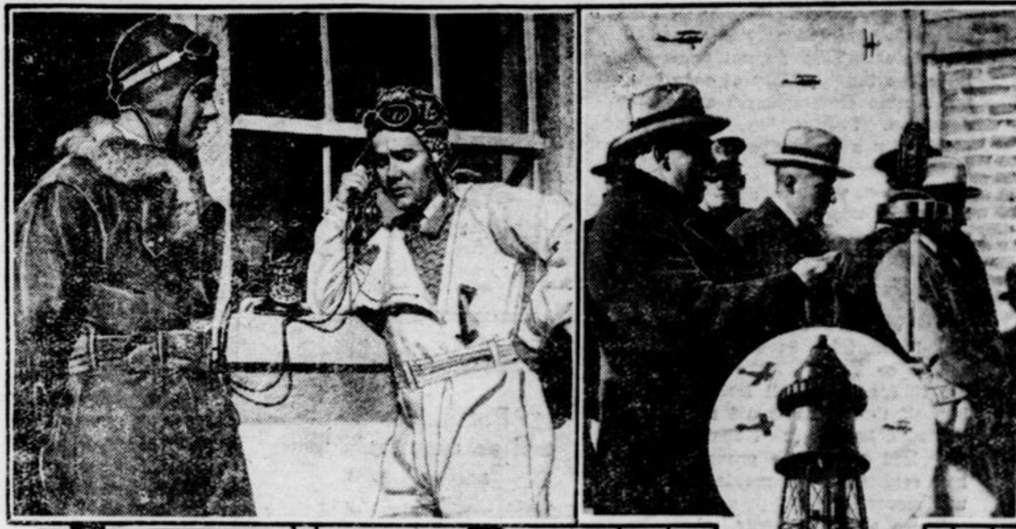
St. Hubert flying field adjoining Montreal will soon be one of the finest transportation centres in the country.

In preparation for the visit of the British Dirigible, the R-101, the mooring mast is being rushed to completion with adequate telephone and other communication equipment. A recent gathering of world-famous flyers at the airport was attended by over 40,000 people and over 70 planes.