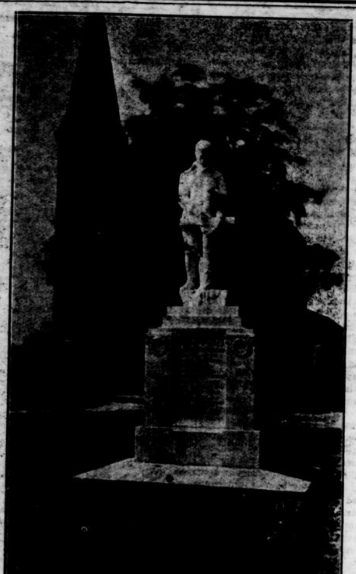
PRICEVILLE'S WAR MEMORIAL