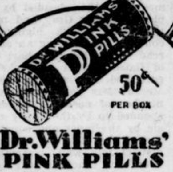
Dr. Williams' PINK PILLS

Start today to improve your appetite. Buy Dr. Williams' Pink Pills from your druggist or by mail, post paid, at 50 cents a box from The Dr. Williams Medicine Co., Brockville, Ontario. Send for free book—"What to Eat and How to Eat."