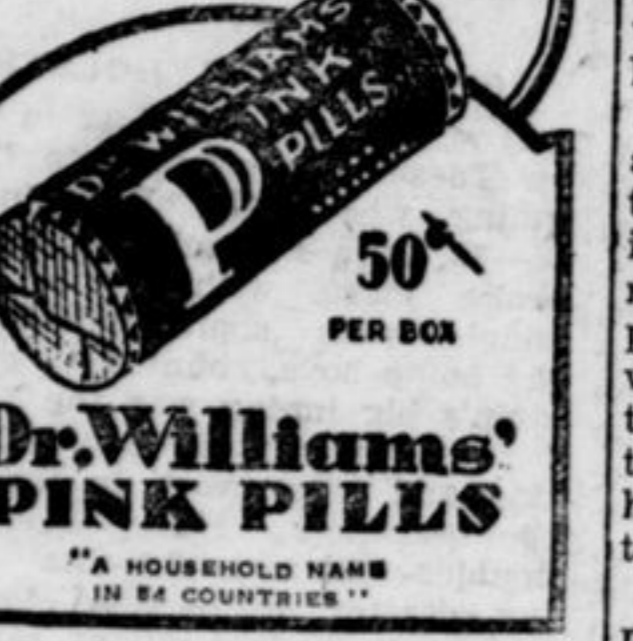
Dr. Williams' PINK PILLS