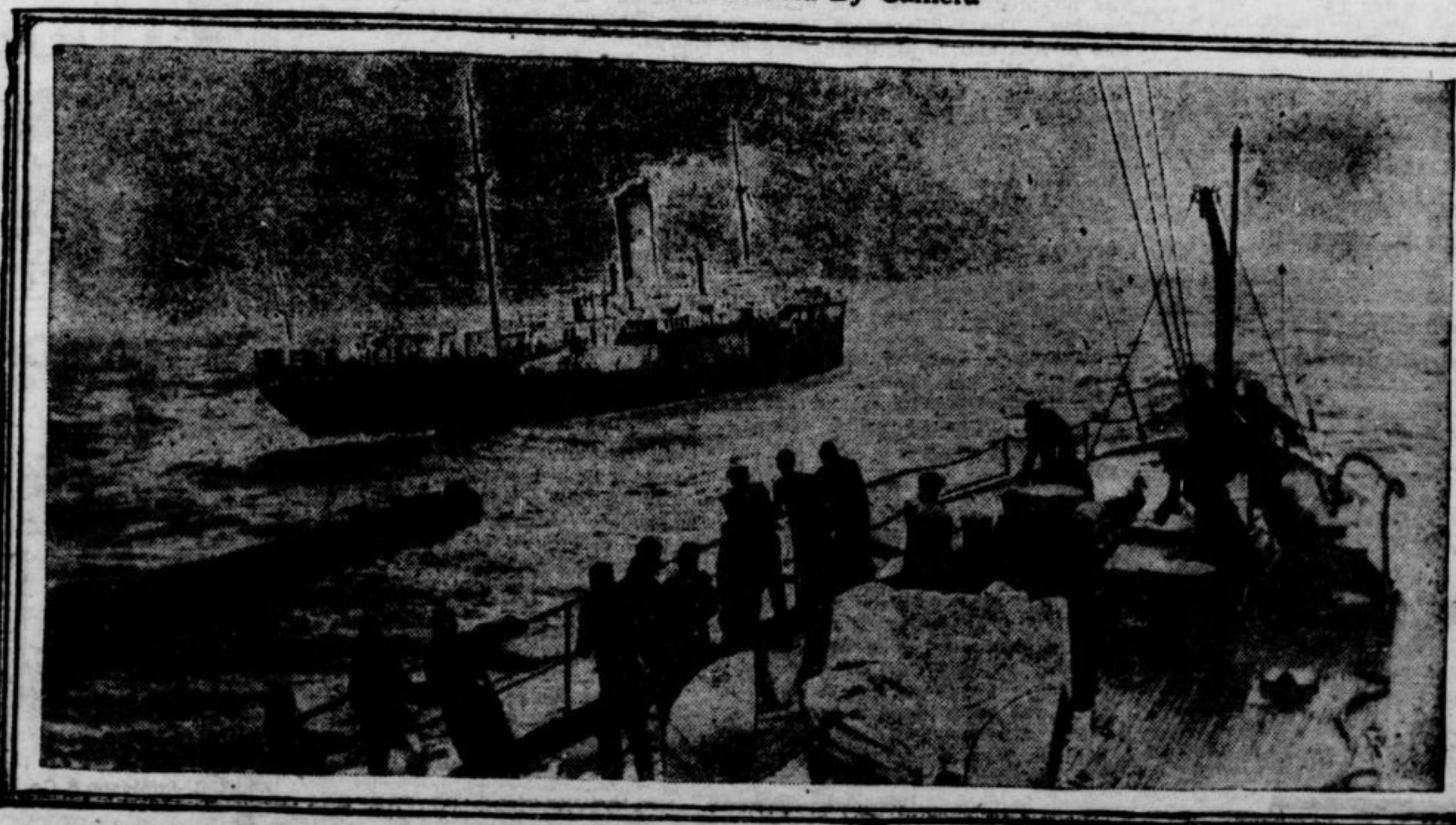
COAST-GUARD CUTTER EFFECTS RESCUE AT SEA. This picture of a rescue at sea was taken as the coast-guard cutter Moja ve passed a tow-line to steamship West Hika disabled and unable to proceed to port.

For the Lights, of Course Suddenly Rich Yacht Owner—"Be sure you have a plentiful supply of green and red oil on board, captain."