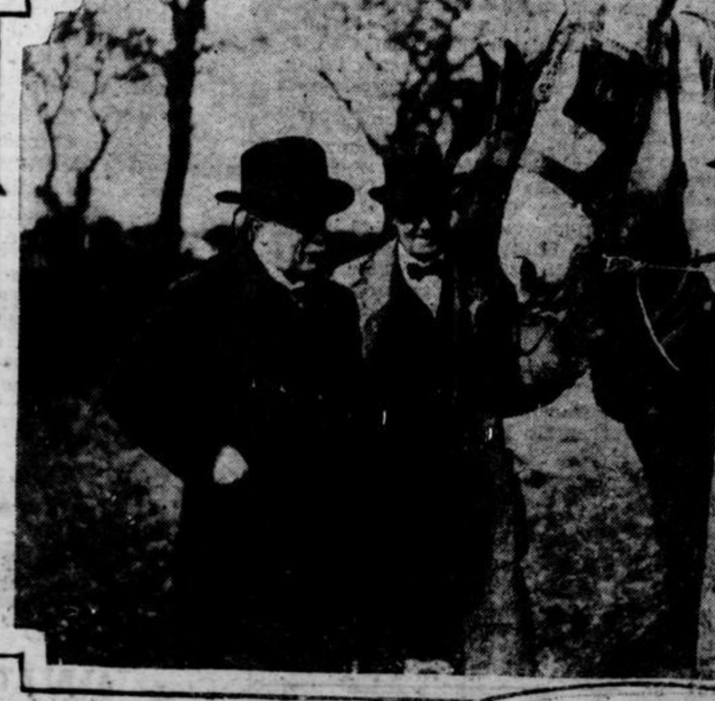
LLOYD GEORGE BELIEVES IN LEARNING CONDITIONS FIRST HAND Canvassing farm-workers with a candidate in the Eidsbury division constituency. He follows the well known plan of giving personal help to as many of his supporters as possible.