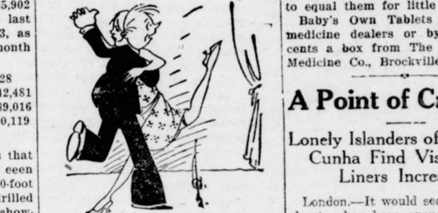
"So Tom is mixed up in one of those triangles, eh?" "Gosh, no! It's a heptagon in his case."

Manitoba Free Press (Lib.): (A delegation from British Columbia is urging the Government to ask Australia for further tariff concessions.) Propositions made by Canada to Australia looking to enlarged opportunities for the sale of Canadian products in the Commonwealth will be met by inquiries as to what Canada has to offer in return. Great Britain, which now has a preferred tariff position in Australia, takes the great bulk of Australia's exports, and the favorable treatment given British goods is a tangible sign of appreciation of that fact. Canada has not been very successful in giving Australia special consideration in return for partial preferences given to Canadian goods under the Australian treaty. The balance of trade is in our favor, something like three to one.