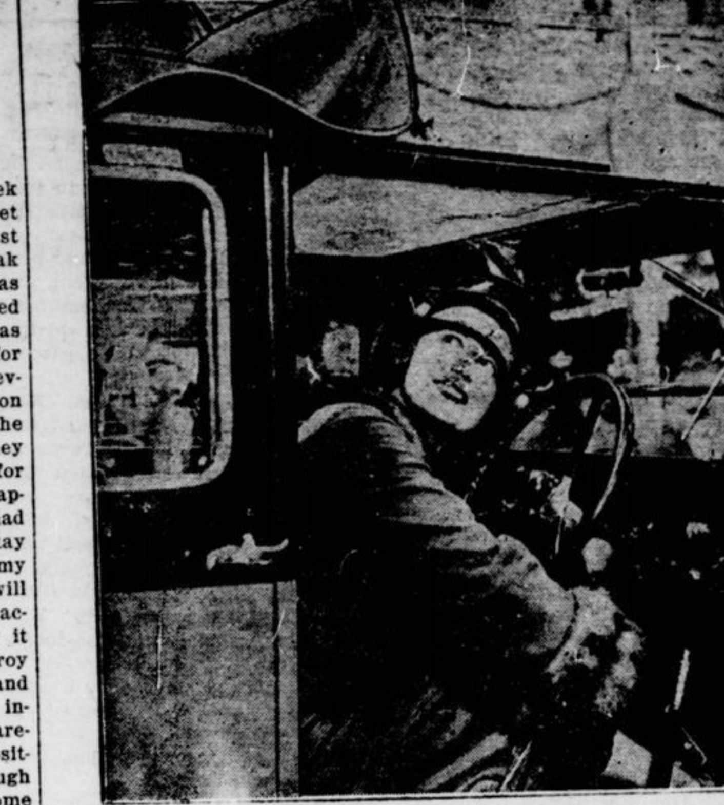
LET'S SUN SHINE IN WHILE ON THE OPEN ROAD A new automobile device at the Olympia show enables the top of a car to be opened with a turn of a handle. It may be put back in its place equally as easily by reversing the lever on the side of the driver's seat.