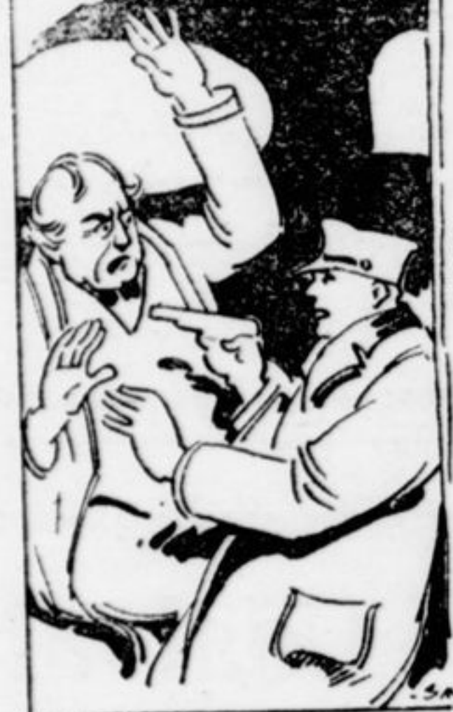
The valet pushed an automatic against the old man's chest.

He waited to see that the search was thoroughly made. No weapon was found on Higgins' person; but still not content, Charlie himself care-