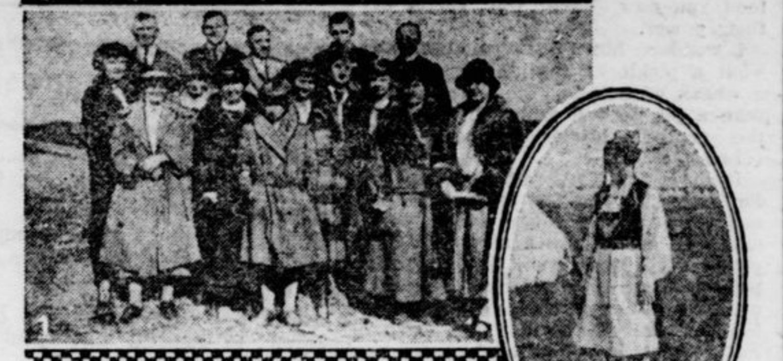
1. A group of Norwegians photographed after having spent a few years in Canada. 2. Young girl dressed in the costume typical of her native country.