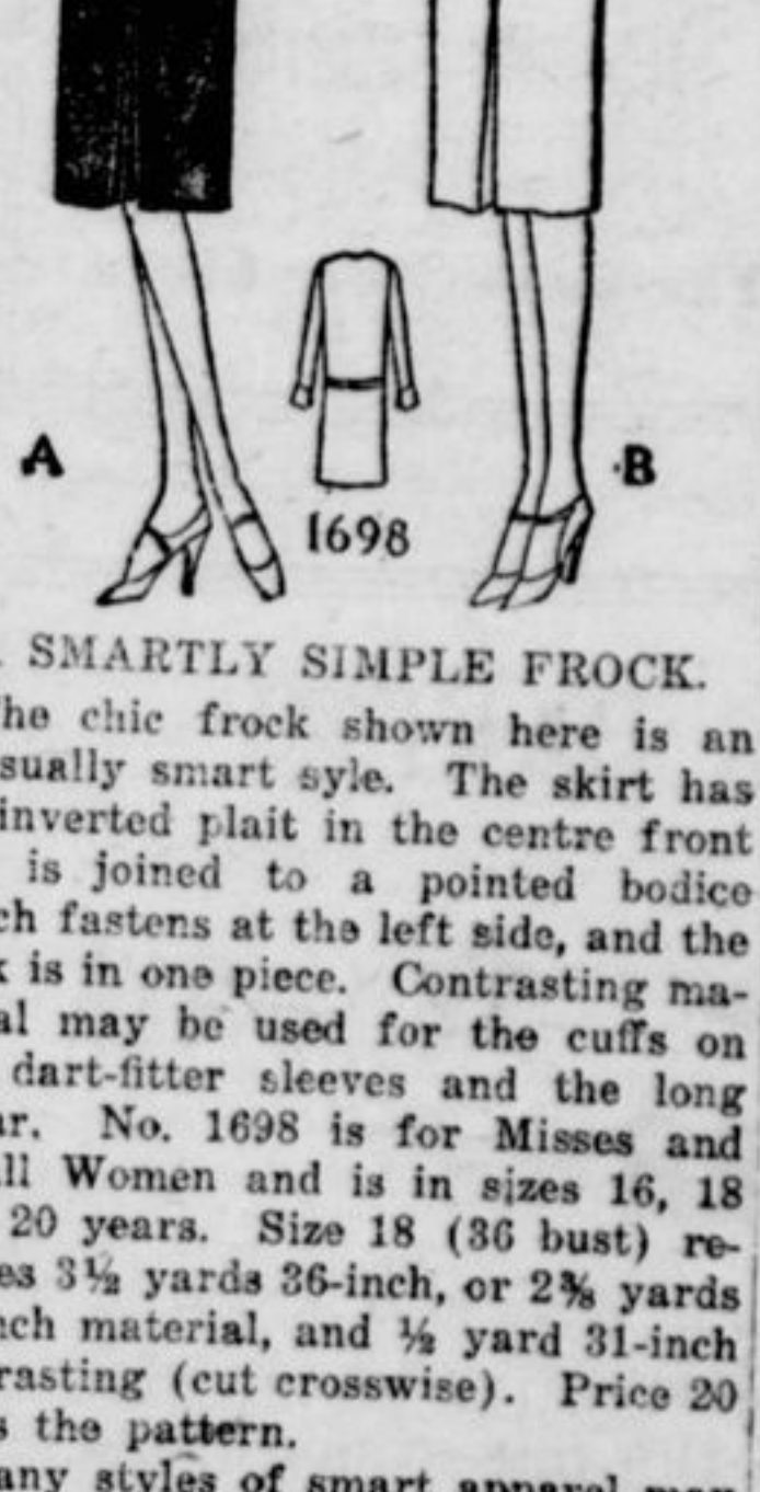
The chic frock shown here is an unusually smart style. The skirt has an inverted pleat in the center front which fastens to a pointed bodice which fastens in the back.