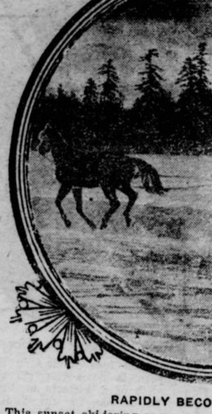
This sunset ski-joring scene comes from Western Ontario, near Preston Springs.