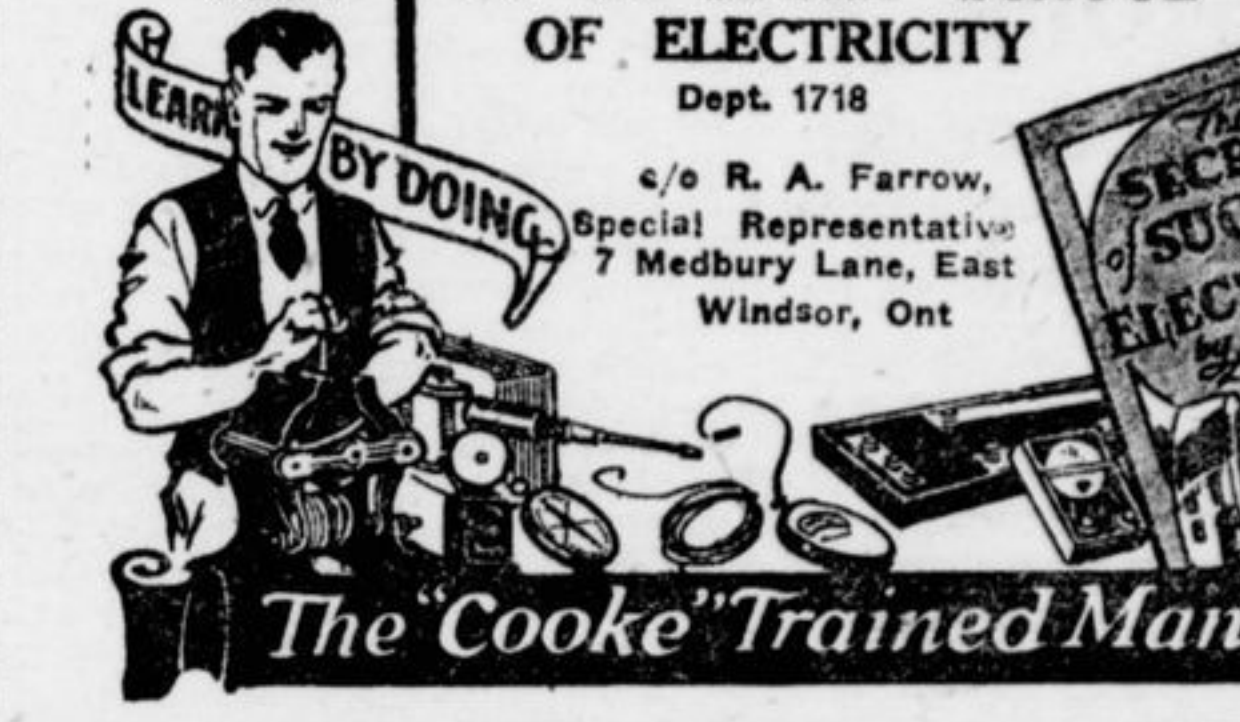
The "Cooke" Trained Man is the Big Pay Man.